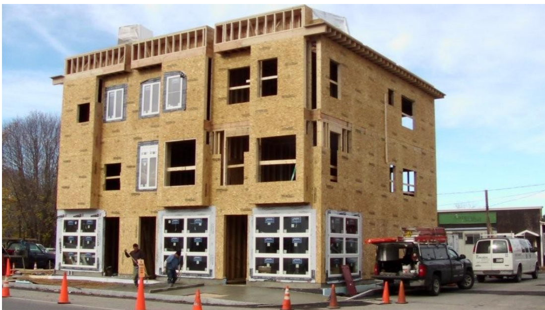
Construction workers complete a new sidewalk in downtown Westbrook, Maine to serve infill residential condominiums and commercial space funded by the Neighborhood Stabilization Program. This live-work building replaces one condemned by the City.