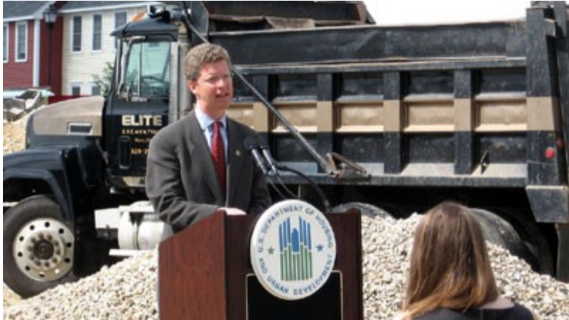
HUD Secretary Shaun Donovan visits Bow Highlands, an affordable housing project in Bow, currently under construction with Recovery Act Tax Credit Assistance Program funds. The project will create 97 jobs and 20 new affordable housing units