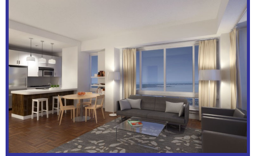
(Right) Unit types range from studio to one- and two-bedroom apartments and three-bedroom penthouses; all units contain smart features for greener living.