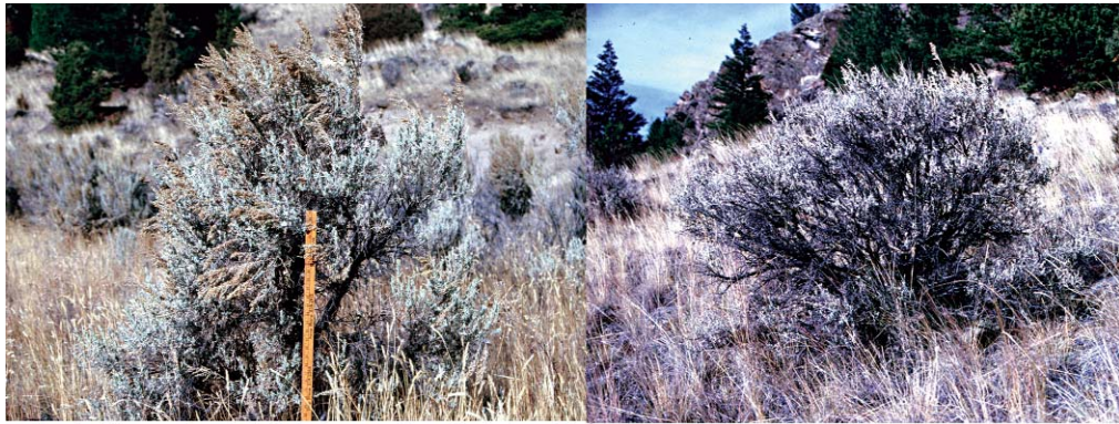
Basin big sagebrush lightly browsed on the left and heavily browsed on the right. Basin big sagebrush is a tall plant standing 1 to 3 m at maturity. Flowerstalks in panicle form arise throughout a relatively uneven crown.