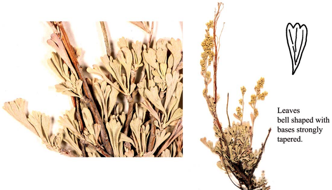
Leaves bell shaped with bases strongly tapered.

ally obtains its moisture by growing in localities with greater amounts of precipitation rather than occupying on very deep soils favored by basin big sagebrush. Soils occupied by mountain big sagebrush range from sandy through silty and clayey textures, and may often be cobbly. However, generally finer textured soils appear to be favored by the taxon. Compared to surrounding upland community types, mountain big sagebrush usually occupies the deeper more mesic locations.