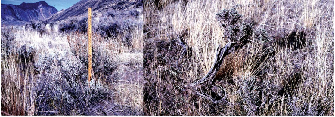
Wyoming big sagebrush lightly browsed on the left and heavily browsed on the right. Wyoming big sagebrush are generally less than a meter tall with flower stalks in a relatively compact crown.