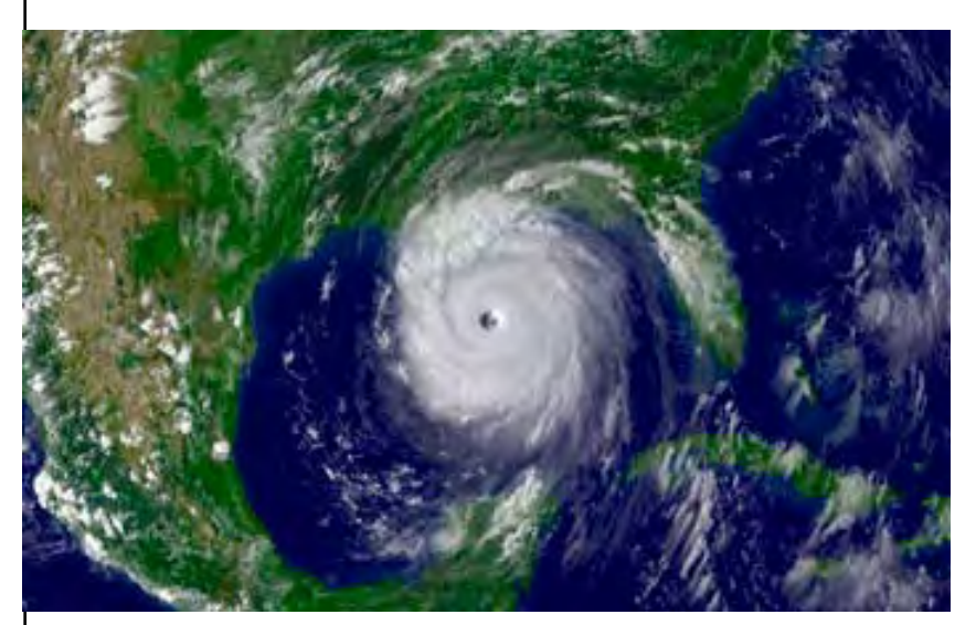
Hurricane Katrina as approached the Louisiana coast.