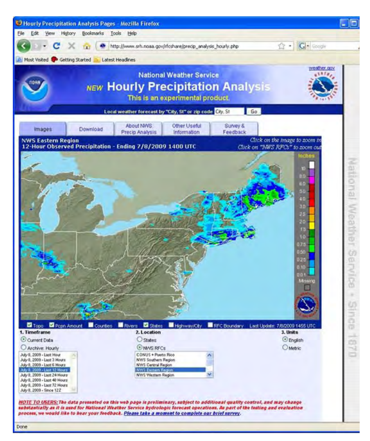
Sample of NWS Hourly Precipitation Estimates.

Due to data coverage across multiple time zones, Universal Coordinated Time (UTC) is used on the Website. *