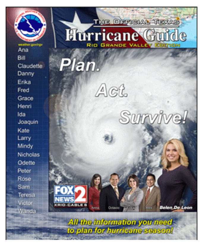
Front page of the 2009 Texas Hurricane Guide, Rio Grande Valley Edition.

NWS Texas coastal offices recognized that collaborative partnerships with a variety of government agencies, private companies, non-profits, the media, academia and emergency