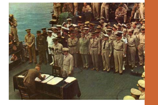
Japanese General Yoshijiro Umezu signs surrender document in front of General MacArthur on 2 September, 1945