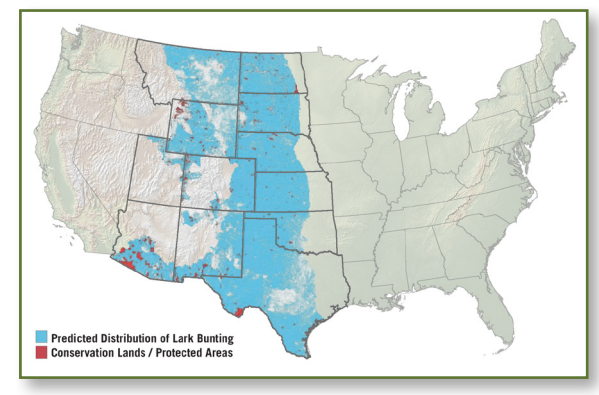
Gap Analysis of Lark Bunting