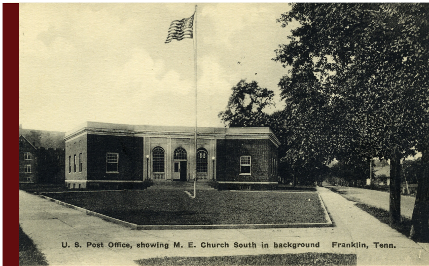
U. S. Post Office, showing M. E. Church South in background Franklin, Tenn.