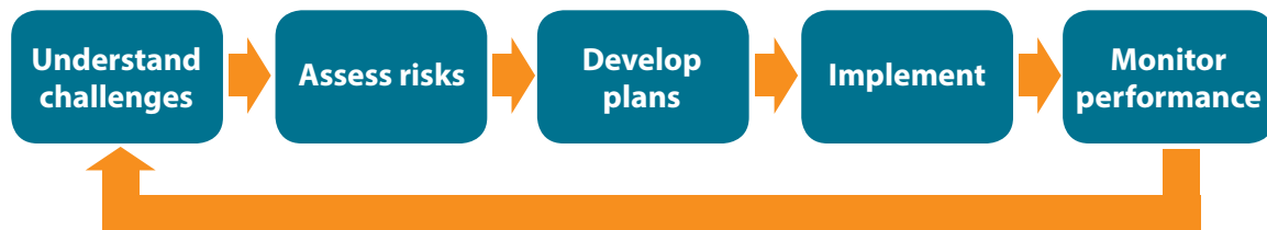
Figure 1: Adaptive Management Process

Adaptive management proves useful in the context of climate change planning because it is an iterative process, emphasizing learning and structured experimentation, while simultaneously adapting to what is learned ( Figure 1 ). It is a knowledge-building system that involves: increased understanding and assessment of challenges and associated risk, development of policies or plans, implementation of these plans and most importantly, monitoring of performance and reconsideration of assessments and updated priorities. Simply put, adaptive management facilitates a process of ‘learning by doing.’ Utilities can continually evaluate their ability to manage and adapt to climate change impacts, and build resiliency.