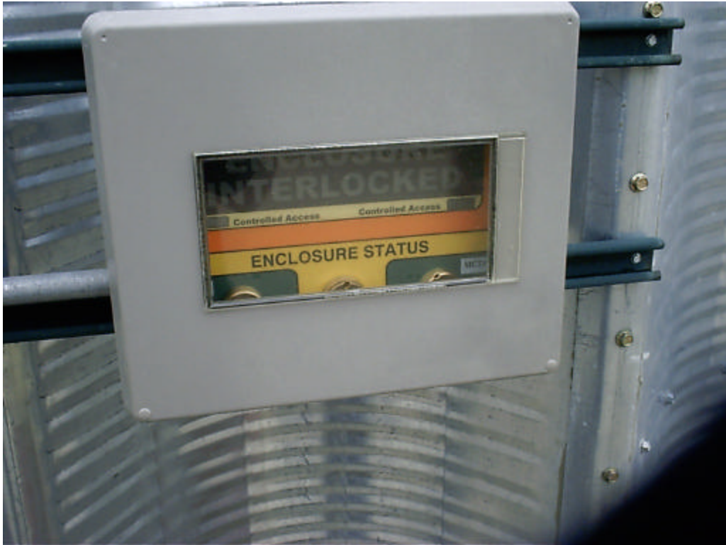
Figure 2 Outside Interlock Box in MIPP