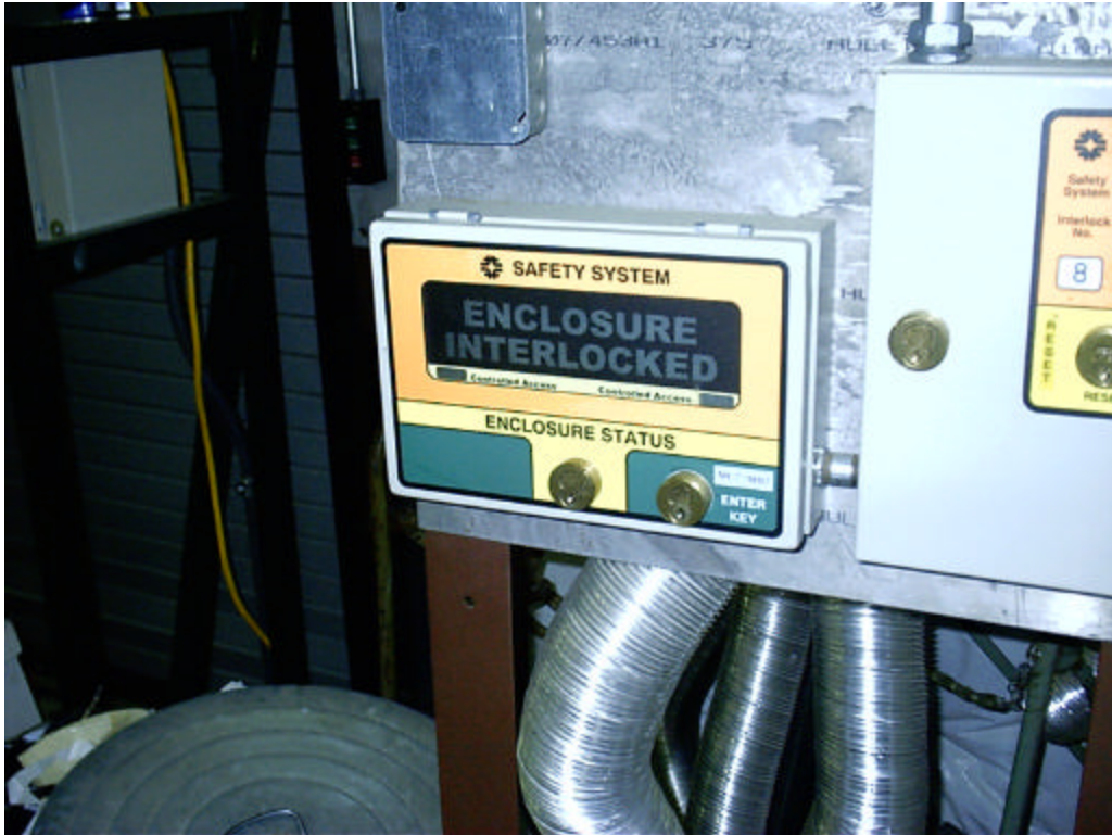
Figure 5 The interlock box inside the MIPP building

After the door is locked, Person B removes the key from the interlock box. The “Enclosure Interlocked” sign should continue flashing if the CA is successful.