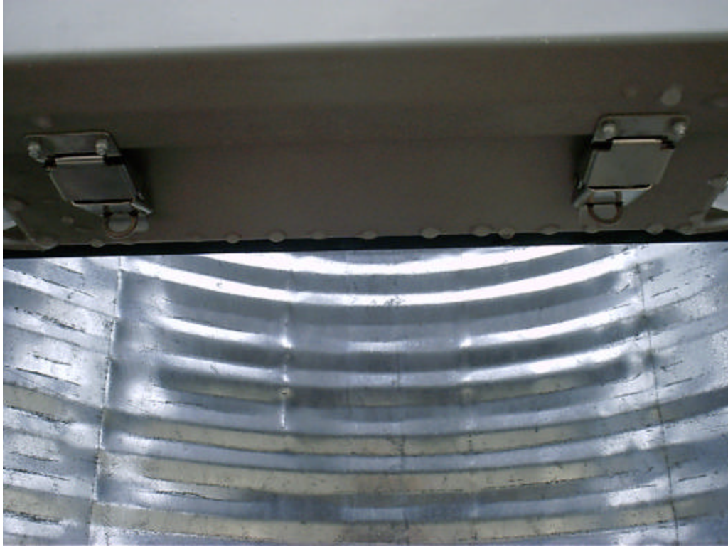
Figure 3 In order to open the outside interlock box, disengage these latches located underneath the box.