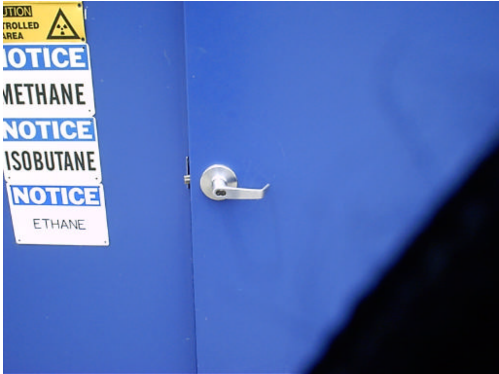
Figure 4 The interlock door into MIPP. This lock is opened using the interlock key.

interlock box lock marked “ENTER KEY” (Figure 5) and turns the key clockwise 90 degrees, till the green light comes on in this box. Person B then says “Green light” signaling that Person A can remove his key from the lock outside. Person A does this and enters the building as well. Person B should continue to keep his key in the Interlock box while this happens. Person A then enters the hall and closes the door shut. Only after the door is shut is Person B allowed to remove his key from the interlock box. Removing this key prematurely (while the door is open) is the most common cause of dropping the interlock.