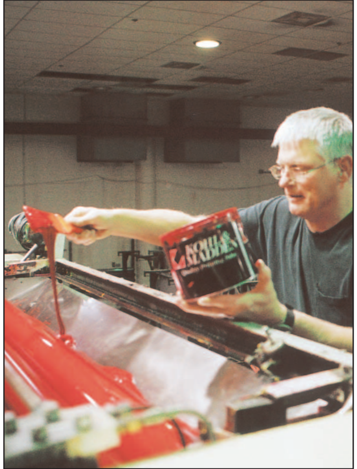
Soy inks possess excellent ‘tack stability’ on the printing press rollers. This is essential in maintaining full and even ink color strength when printing the very fine lines of many USGS map products.

“The soy ink was much easier for our pressmen to control, resulting in less material waste and press downtime,” Kiser says. “It is a far more efficient ink for that kind of printing because it lasts longer, allowing us to print more with less down time because of fewer wash-ups.”