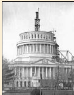
Construction of the new cast-iron dome was well under way in 1861 (left).