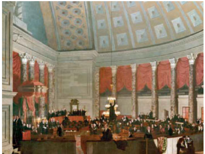
The Old Hall of the House of Representatives, as painted by Samuel F.B. Morse, in the collection of The Corcoran Gallery of Art.