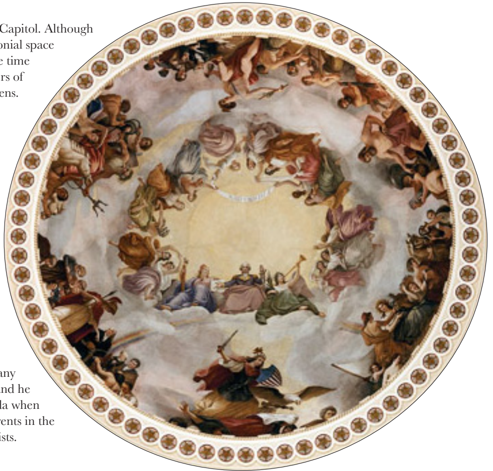
Constantino Brumidi painted "The Apotheosis of Washington" inside the Capitol Dome in 1865.

Hanging in the Rotunda are four giant canvases painted by John Trumbull, an aide-de-camp to General Washington, who painted scenes of the American Revolution. Paintings by four other artists depict events associated with the exploration and settlement of the United States. On the canopy, suspended 180 feet above the Rotunda floor, the Italian-American artist Constantino Brumidi painted The Apotheosis of Washington . It shows George Washington surrounded by symbols of American democracy and technological progress. Brumidi painted and decorated many of the rooms and corridors of the Capitol, and he was painting the frieze that rings the Rotunda when he died. His work, which illustrates major events in the Nation's history, was completed by other artists.