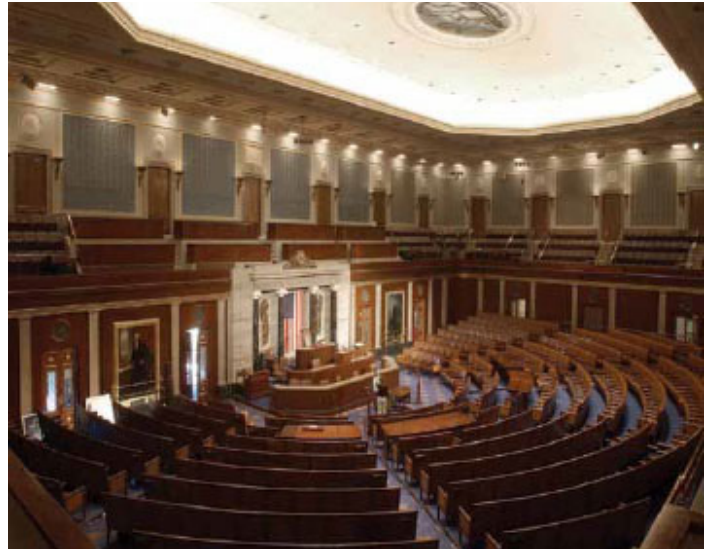
The Chamber of the House of Representatives.

Offices of representatives are located in the three buildings on the south side of the Capitol along Independence Avenue: the Cannon, Longworth, and Rayburn Buildings. Senators have offices in the three buildings on the north side of the Capitol along Constitution Avenue: the Russell, Dirksen, and Hart Buildings.