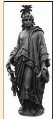
The Statue of Freedom tops the dome (above).