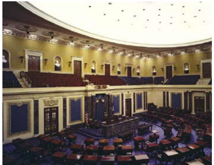
The Senate Chamber.

The Senate moved into its current chamber when the new north wing of the Capitol was completed in 1859. A presiding officer presides from the central dais. The tiers below are assigned to Senate officers and clerks. One hundred desks are arranged in a semicircular pattern and are assigned according to party affiliation. Except on rare occasions, chamber proceedings are open to the public, and Senate galleries are provided for the press, staff, family, diplomats, and visitors. Since 1986, the Senate's daily proceedings have been televised.