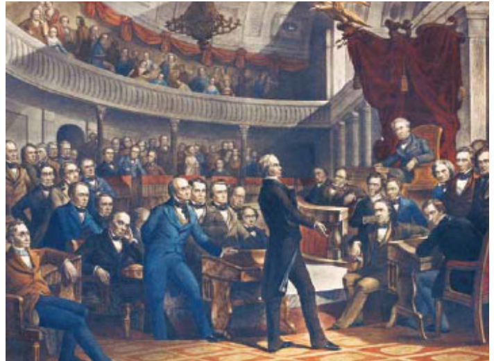
Senator Henry Clay speaks on behalf of the Compromise of 1850 in the Old Senate Chamber.

In 1819, the reconstructed wings of the Capitol were reopened. The center building, completed in 1826, joined the two wings. A low wood and copper dome covered the Rotunda.