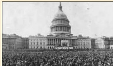
Presidential inaugurations have taken place at the Capitol since 1801. Seen here is Calvin Coolidge's inauguration in 1925.