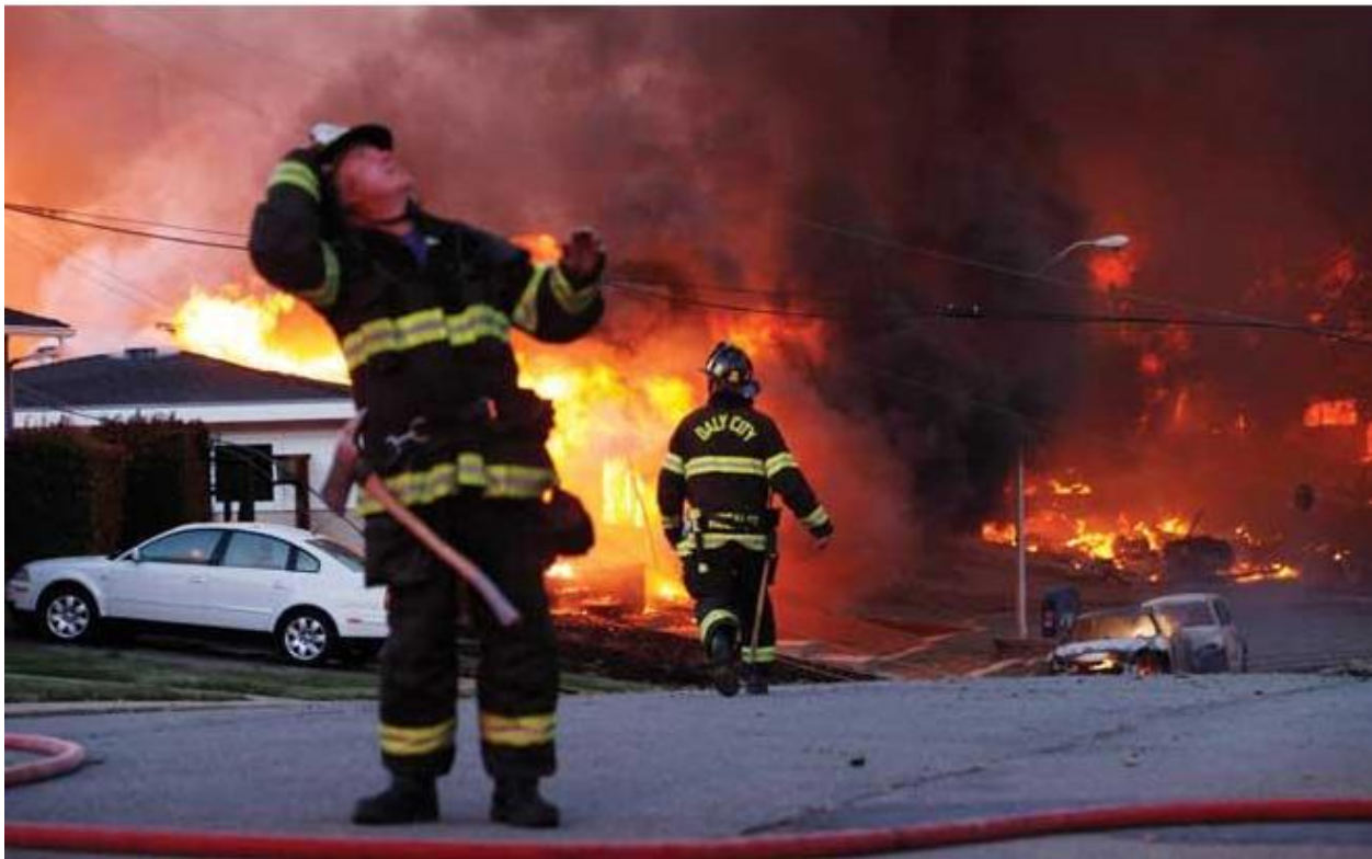
A massive fire roars through a mostly residential neighborhood in San Bruno, Calif., following a pipeline explosion that killed eight people and incinerated the neighborhood.

Despite these facts, several recent pipeline incidents have highlighted the need for communities to be adequately prepared for pipeline emergencies. In September 2010, a gas pipeline rupture and the subsequent ignition in San Bruno, Calif., caused eight fatalities, injuries to more than 60 people, the complete destruction of 38 homes, and damage to 70 other homes. An investigation of the incident revealed that the local emergency responders were not adequately prepared to respond to the pipeline emergency.