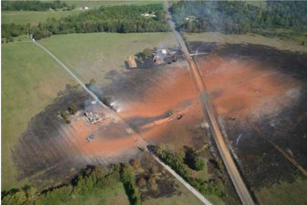
An aerial view of the impact of a natural gas pipeline rupture and fire in Appomattox, Va., in 2008, that demolished two houses and damaged buildings 400 yards away.