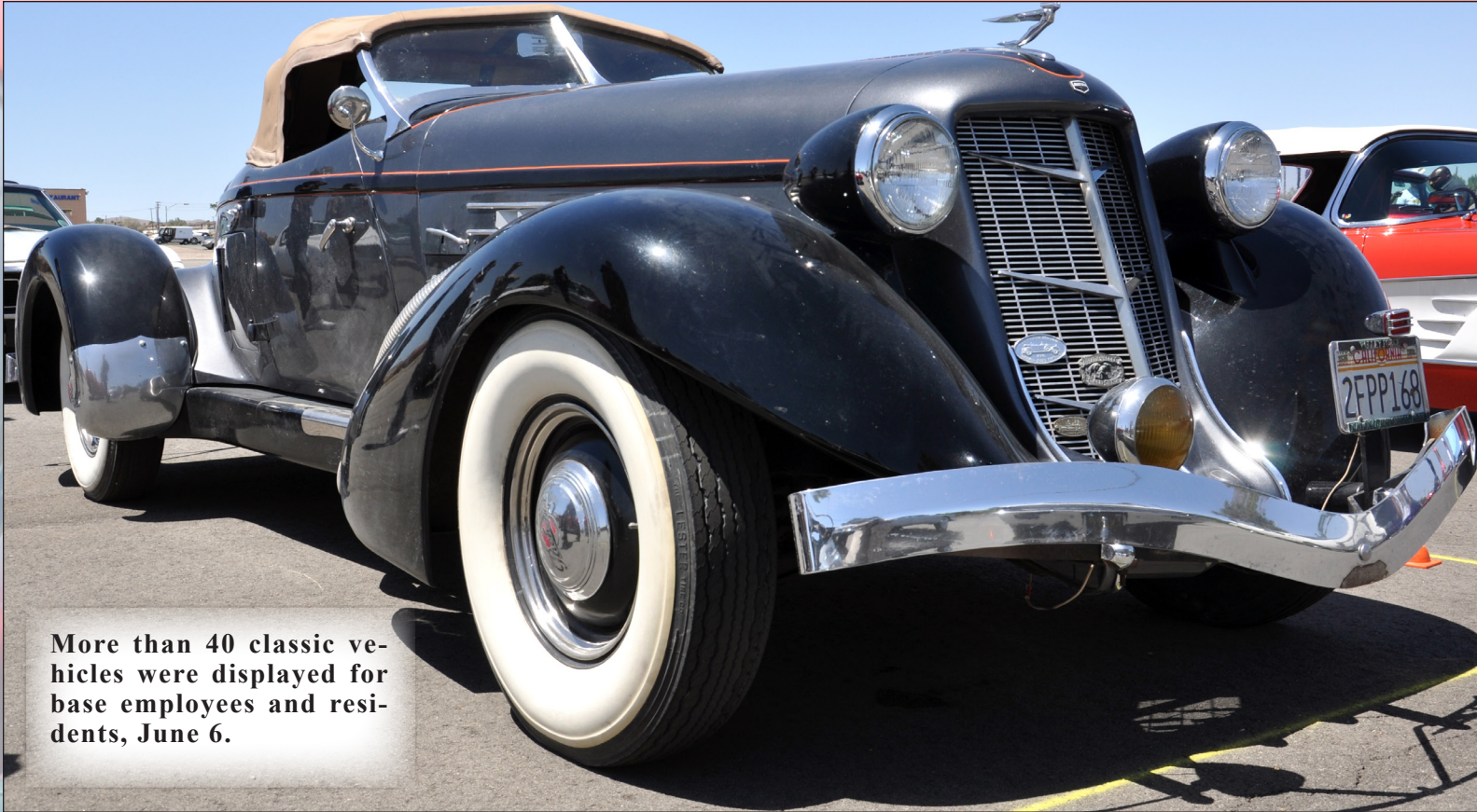
More than 40 classic vehicles were displayed for base employees and residents, June 6.