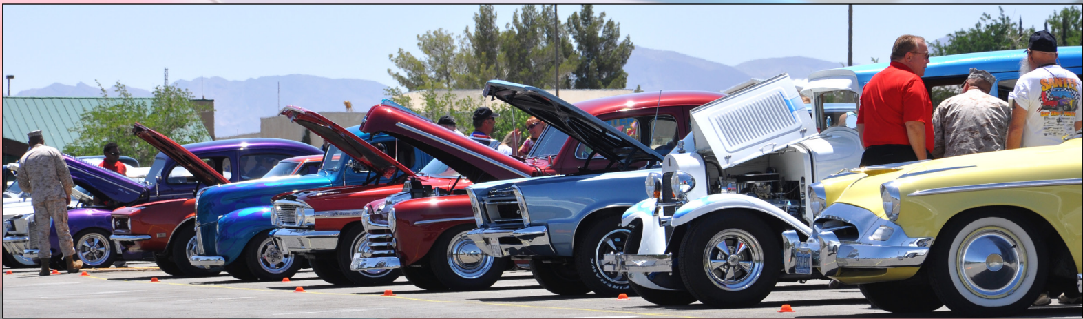
(Above) Car buffs of Marine Corps Logistics Base Barstow were in for a treat when the 'Round Nevada Classic Car Tour' visited the base, June 6. More than 40 vehicles were displayed.