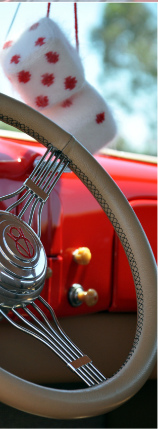
Interior was displayed at car show. Sgt. Hernandez, maintenance chief, is seen aboard MCLB Barstow with many classic vehicles.