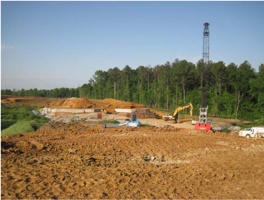
Construction of Viaduct Footings Birmingham Intermodal Facility