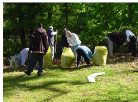
CSOSA offenders engage in community service

CSOSA refers offenders with court-ordered community service requirements to non-profit organizations that provide a wide range of services that benefit District of Columbia residents. CSOSA also enters agreements with non-profit organizations and civic groups that host one-time events intended to achieve community improvements, such as cleaning up and installing playground equipment in a park. The Community Service Program seeks to encourage a sense of investment in the community on the part of offenders while strengthening the community's commitment to embrace all members of the society.