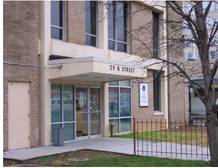
CSOSA Field Office at 25 K St NE.

NEIGHBORHOOD-BASED SUPERVISION: In order to place Community Supervision Officers and facilities close to the neighborhoods where offenders live, CSOSA operates six field units, two com-