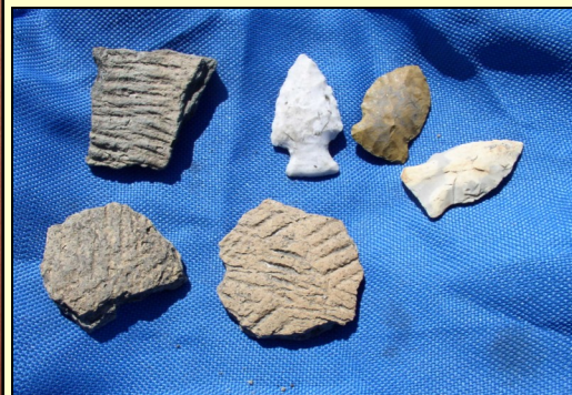
Pictured on the left are spear and arrow heads and displayed on the right are shards of ancient pottery and more arrow heads found at pre-historic site 21NR70.