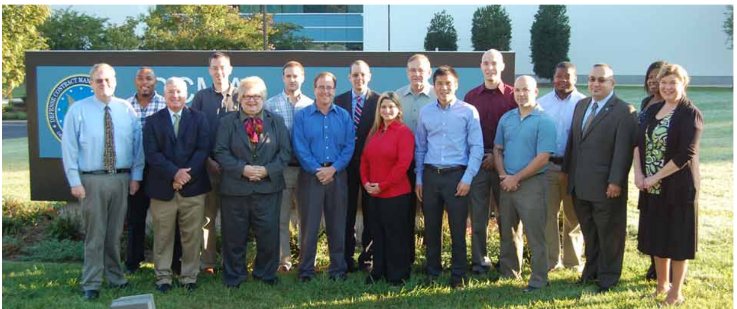
A recent Defense Contract Management Agency Special Programs New-Hire Boot Camp class poses for a photo in front of DCMA Headquarters at Fort Lee, Va. The new-hire boot camp assists employees with their transition into working in a more classified environment.

The Boot Camp covers important topics over three days. The NHBC brings together Defense Acquisition subject-matter experts and those supporting the acquisition