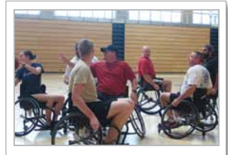
Warrior Transition Unit members at the U.S. Army Garrison in Wiesbaden, Germany, and Defense Contract Management Agency Southern Europe employees enjoy a game of wheelchair basketball.

The U.S. Army established WTUs at major military treatment facilities located around the world, according to the U.S. Army Warrior Transition Command. WTUs provide personal support to wounded soldiers who require rehabilitative care and complex