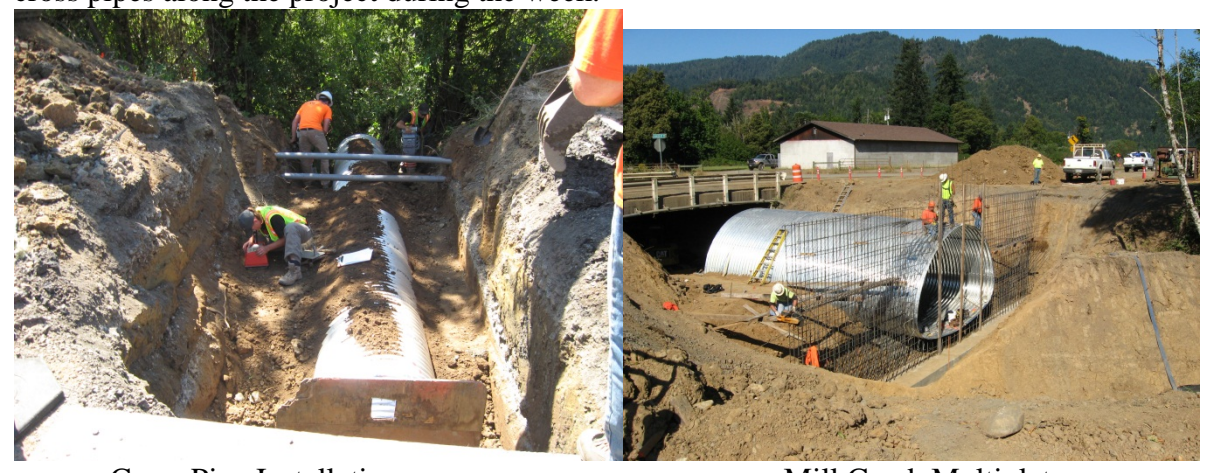
Cross Pipe Installation

Tidewater crews spent most of the week of August 15<sup>th</sup> working at the Mill Creek site placing the large multiplate culvert. Crews were able to prepare the base and set a section of the pipe. Crews are now working on the upstream concrete headwall. Tidewater also installed several cross pipes along the project during the week.