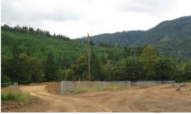
Excavation at Hayes Creek