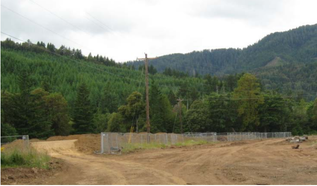
Excavation at Hayes Creek