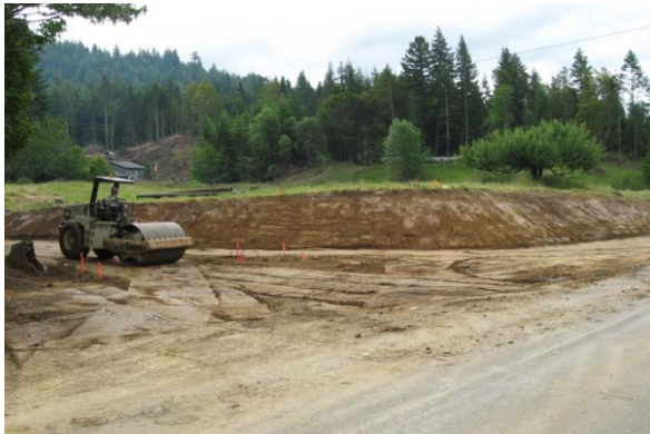
Excavation at Hayes Creek

Tidewater crews spent most of the week of July 4 th working on the bypass road at Hayes Creek in preparation for the bridge construction work. Traffic will continue to use the existing roadway until the week of July 18 th . The traffic will then be routed to the bypass until mid-September. The bypass will provide for only one way traffic so flaggers or a signal system will be in place. Work also began the Mill Creek site in preparation for a large pipe installation. Traffic will continue to use the existing bridge.