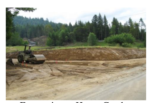
Excavation at Hayes Creek

Tidewater installed a culvert cross pipe this week near Mill Creek. This was the only inroad construction that was done, however crews cleared and grubbed the area bordering Banner Creek and excavation continued in other sections of the project. The Powers/Agness Road is clear for the holiday weekend and no delays due to construction should be anticipated. Have a safe and relaxing Fourth of July.