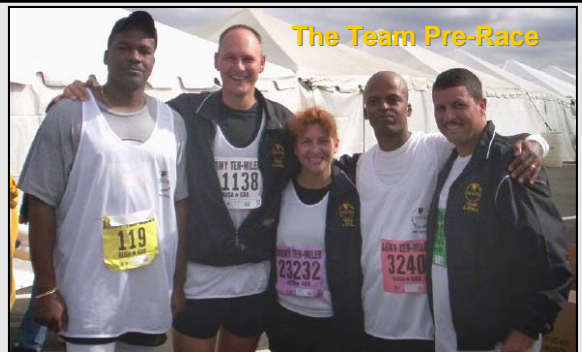
The Team Pre-Race