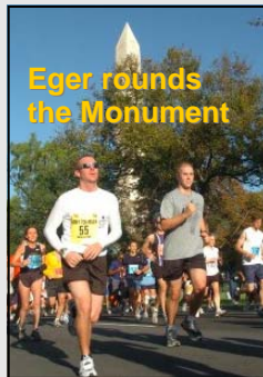
Eger rounds the Monument