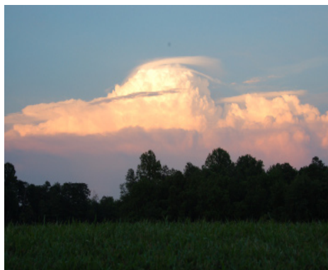
A summer storm builds towards Essex County