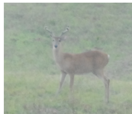
A buck pauses from dinner for this photo at 400 meters away