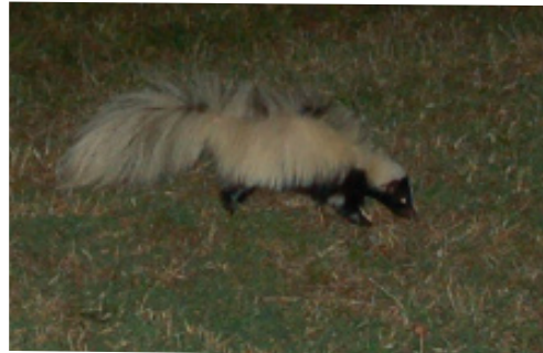
Skunks like this one can be found most anywhere on Fort A.P. Hill. This one has been spotted outside Department of Logistics many times.

The life history of both of these skunks is very similar as they both occupy the same habitat. They live in many different types of habitat which include, old fields, forests and cropland. They are often found on Fort A.P. Hill living in beaver maintained habitats. Skunks are not normally social animals but they will share the den sites with other skunks and animals in the winter. They will use the burrows and dens of other animals before they will make one of their own. The skunks normally occupy the underground den sites and burrows of other animals in the winter and then move to above ground dens in the summer time. They are not territorial except when raising their young, at other times they just wander around in search of food and they will den down wherever convenient. Skunks are omnivores and will eat anything from