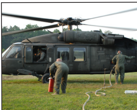
Soldiers from the Virginia and Maryland National Guard refuel a Blackhawk Helicopter, July 12, on Fort A.P. Hill.