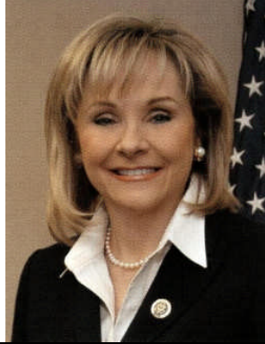
Governor Mary Fallin