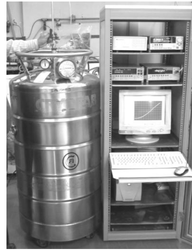
Figure -1: Experimental set up

We have followed most widely accepted definition of RRR of Nb by international research laboratories. RRR is defined as the ratio of the resistance of sample at room temperature (300K) and resistance at temperature just before its superconducting transition ( \sim 10 K for Nb) [3]. The resistance measurement is performed using a standard four-probe method. Current is fed by a stable DC source (Keithley 2611 source meter) and voltage is read through Keithley 2182 voltmeter (resolution of 1n-volt). Temperature is sensed using DT-470 silicon diode and is monitored through Lakeshore 218s temperature