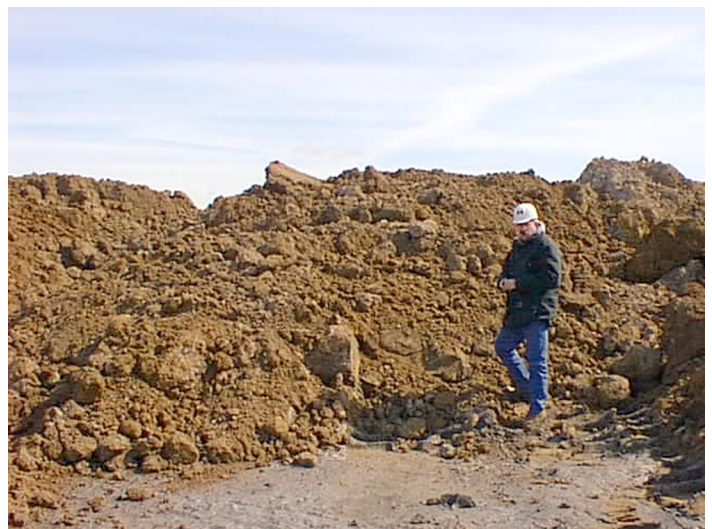
On this site, the coal mine operator has restored more than double the amount required for successful restoration.

Operators must complete the final grading in a timely manner; usually in time for the next growing season. This includes any subsoil or topsoil replacement and installation of erosion control measures such as terraces, diversions, grass waterways and drains.