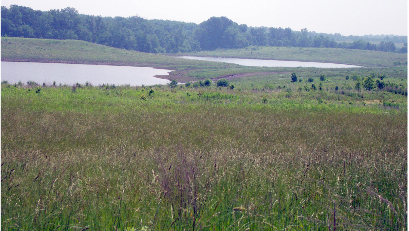
2000 National award winning reclamation at the Columbia Mine