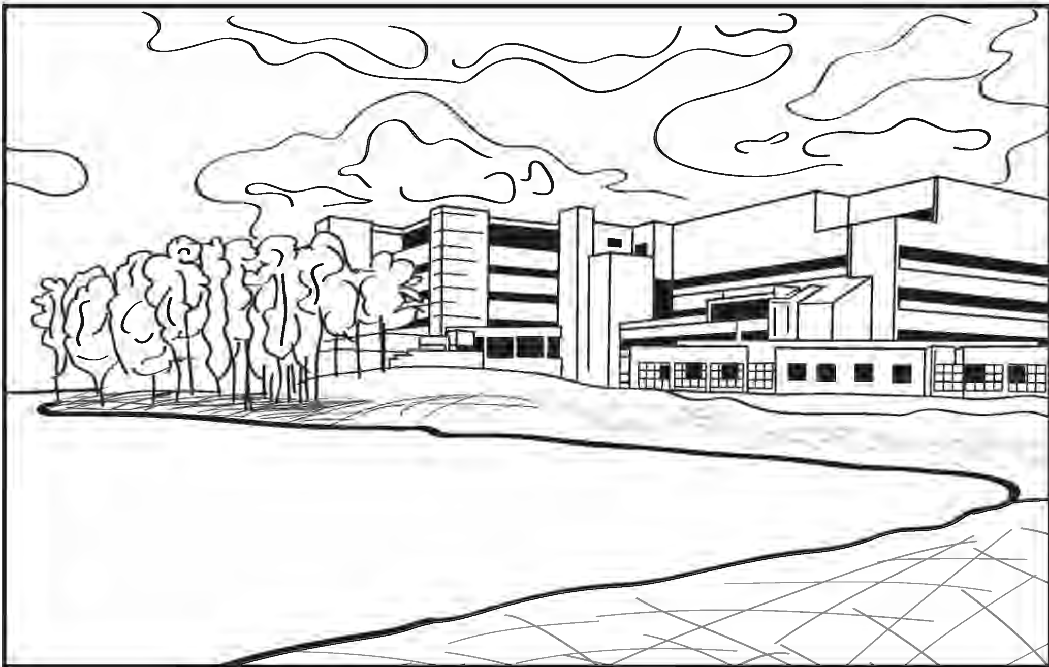
The National Institute of Environmental Health Sciences