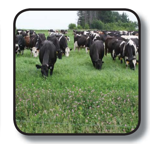
Protect Air Quality