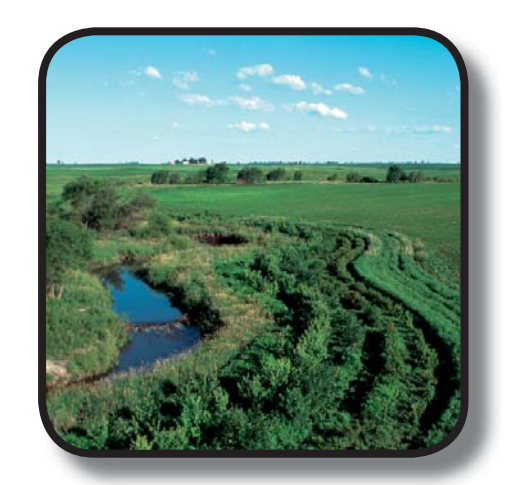
Protect Water Quality