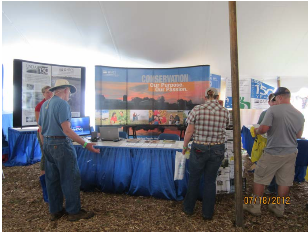
Progress Pavilion – Farm Tech Days 2012