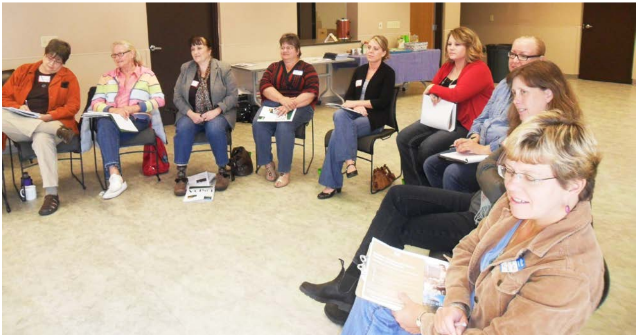
Women Caring for the Land Workshop held in Lafayette County in September, 2012