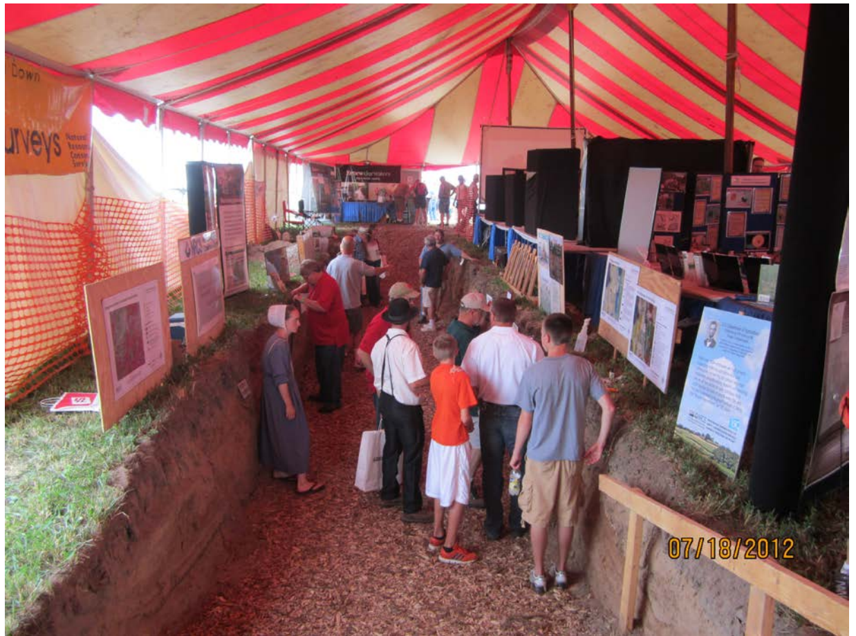
Soil Pit Display - Farm Tech Days 2012