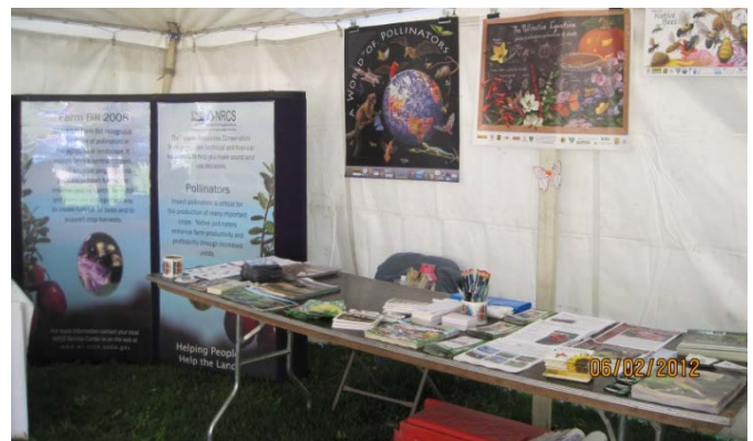
NRCS display at the Dunn County Breakfast.

The Baier family farm has been in operation since 1857 and in August of 2011 the family was awarded the Century and the Sesquicentennial farm awards from the Wisconsin State fair for 155 years of continuous ownership. NRCS assisted the Dunn County Dairy Promotion Committee with staffing along with other partners and had an a booth with information about pollinators, residue management, and backyard conservation.