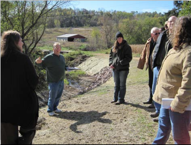
NRCS participating in Columbia County LWCD Fall Tour

In cooperation with Columbia County FSA, local Service Center had a joint booth at the Columbia County Fair to create awareness of conservation & programs available from NRCS, FSA & Columbia Co LWCD. This outreach project allowed staff to talk with both traditional & untraditional customers, which included several women & minorities.