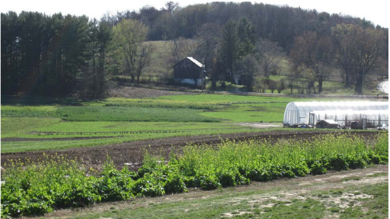
The Season High Tunnel Pilot Project has introduced many new customers to NRCS, leading them to initiate other types of practices for erosion and runoff control, nutrient management and water quality practices.