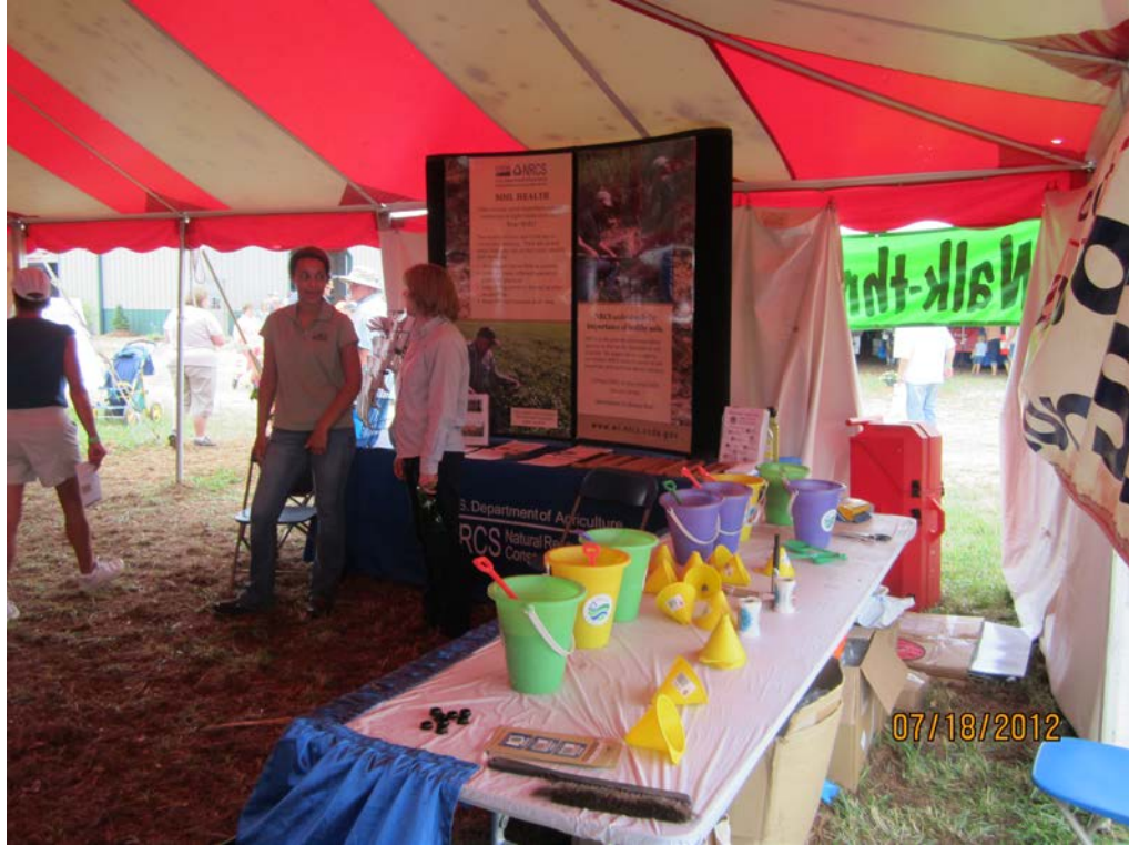
Conservation Tent – Farm Tech Days 2012