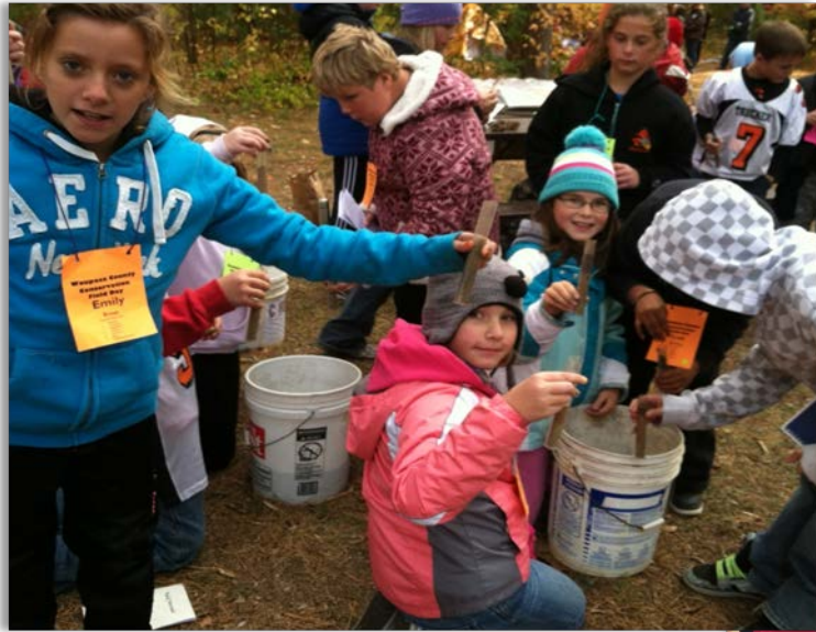
Waupaca Conservation Field Day