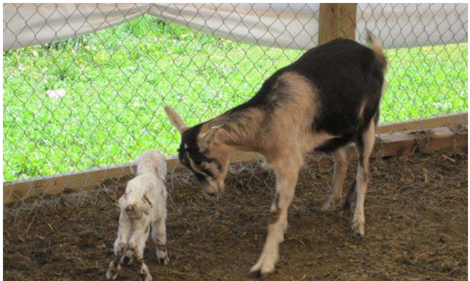
This doe gave birth to twins as we were standing in the barn.