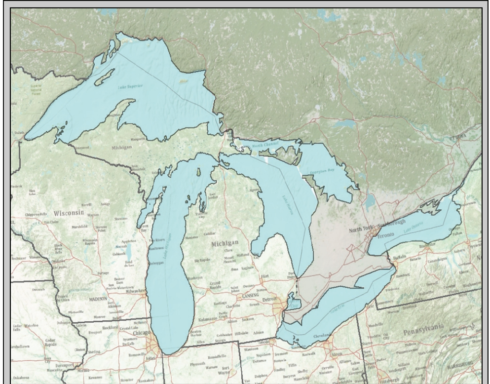
The IOOS Great Lakes Region includes New York, Pennsylvania, Ohio, Indiana, Illinois, Wisconsin, Minnesota, and Michigan, as well as two Canadian provinces.

This IOOS region is expanding and integrating the network of observations and forecasts, as well as coordinating the work of many IOOS partners in the area.