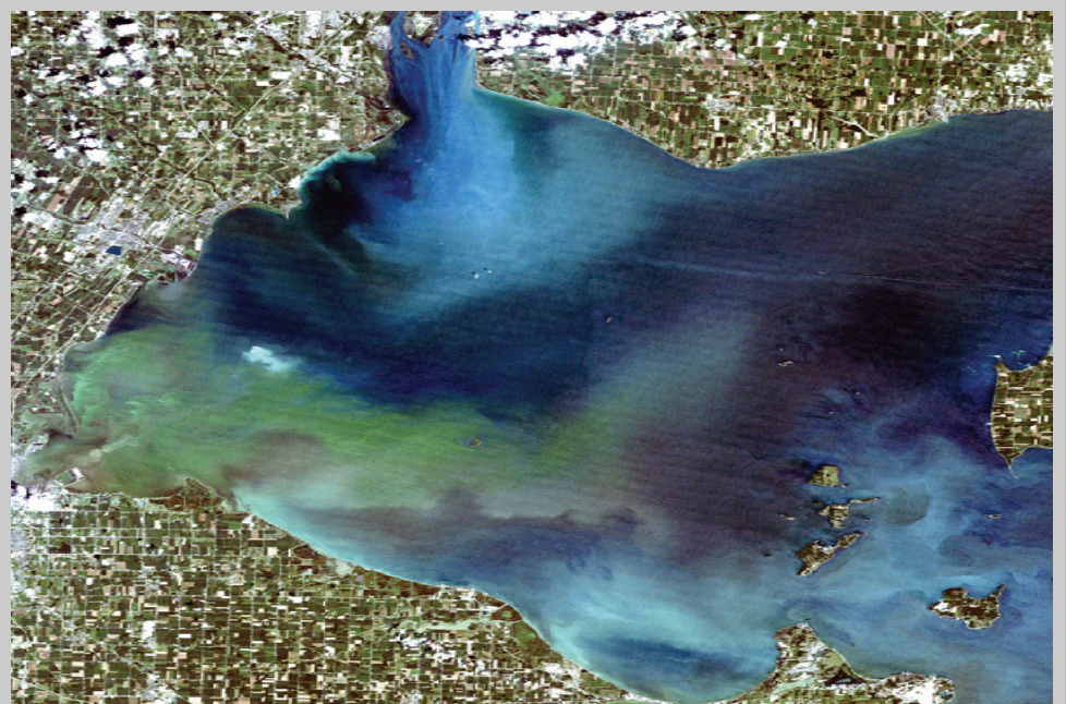
A national monitoring network will improve management of our waters - from inland to coasts to oceans. The Advisory Committee on Water Information and the National Water Quality Monitoring Council developed the initial design for a National Water Quality Monitoring Network. This photo shows how the Network can track substances such as the algae shown here in Lake Erie.

Integrated ocean information is now available in near real time, and retrospectively. Easier and better access to this information is improving our ability to understand and predict ecosystem events such as habitat degradation, harmful algal blooms, and beach closures. This knowledge is used for management decisions such as earlier and more accurate