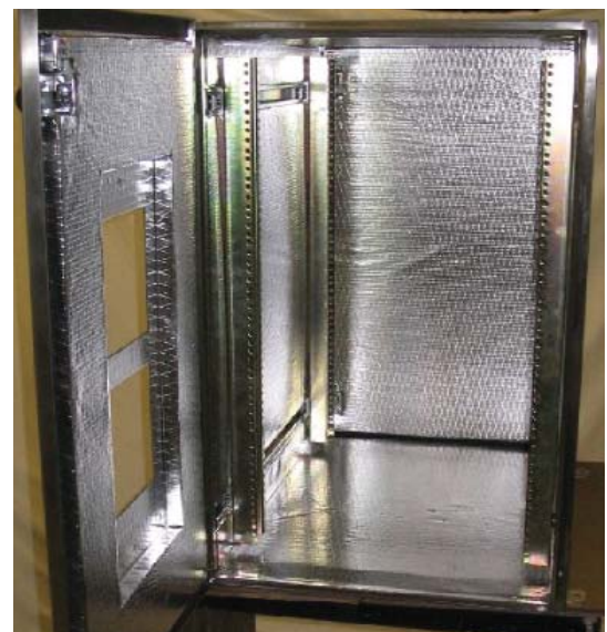
Figure 2. View of outdoor electronics enclosure with both doors open. Air conditioner is attached and all HFR electronics are mounted within the enclosure.