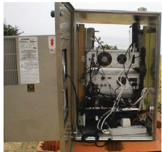
Figure 1. Interior of empty outdoor electronics enclosure without air-conditioner attached.

The enclosure should be bolted to a pallet to provide ground clearance for front and rear doors. An electrical outlet can be installed inside the enclosure to provide power distribution from electrical wiring entering through the cableway gland.