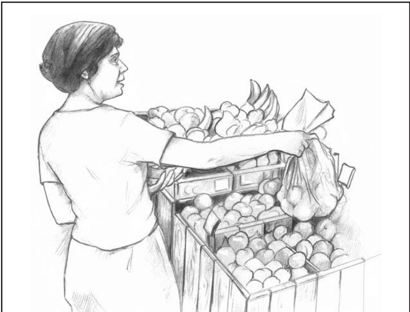
High-fiber foods include fruits and vegetables.

Eating foods high in fiber is simple and can help reduce diverticular disease symptoms and problems.