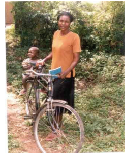
A community health worker ferries a sick child to hospital using a bicycle provided by AB2000

The orphans have benefited from an AB2000 run feeding program, while the widows have also received bicycles, which the community health workers use