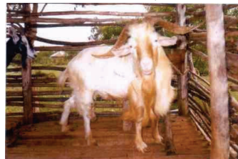
One of the dairy goats bought for the women's group

Back in his community, he has initiated various projects for poverty alleviation and HIV/AIDS widows and orphans support. His organization AB2000 provides pediatric care, psychosocial support and counseling for the community through Kaluoch Widows and Orphans Group . It also supports an outreach VCT program, provides supplies for early childhood education, and