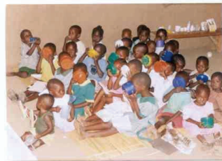
Children having their meal on the feeding program