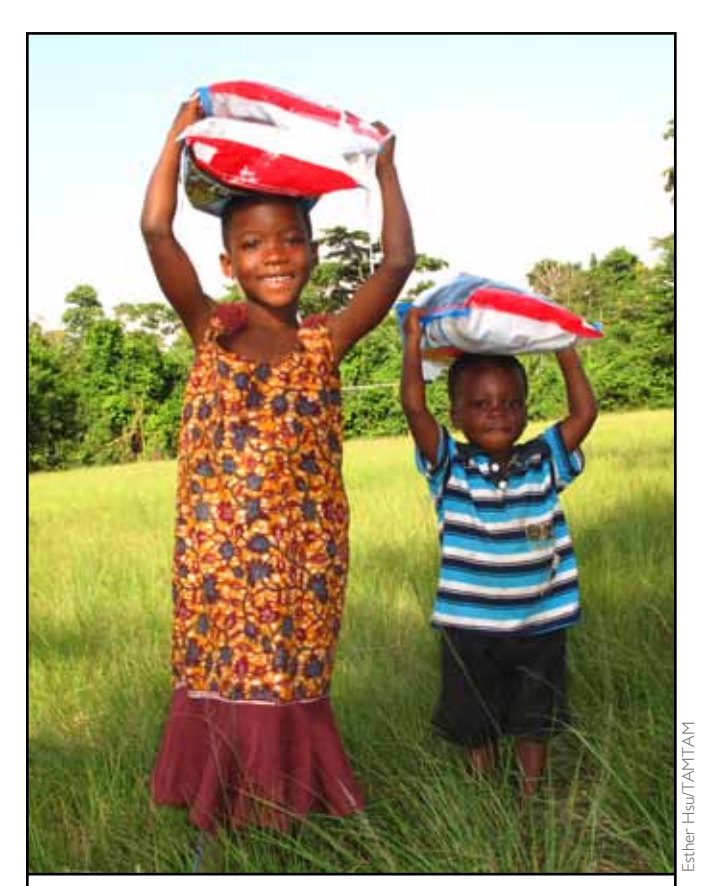
Children carry home long-lasting ITNs they received free of charge during a universal coverage campaign in Eastern Region, Ghana . Over the past five years, PMI has protected millions of people from malaria by contributing to the dramatic scale-up of prevention and treatment coverage across its focus countries, including procurement of more than 45 million nets.

in children under five are reported to be caused by malaria. Economists estimate that malaria accounts for approximately 40 percent of public health expenditures in some countries in Africa and causes an annual loss of $12 billion, or 1.3 percent of the continent's gross domestic product.<sup>4</sup> Because most malaria transmission occurs in rural areas, the greatest burden of the disease usually falls on families who have lower incomes and whose access to health care is most limited.