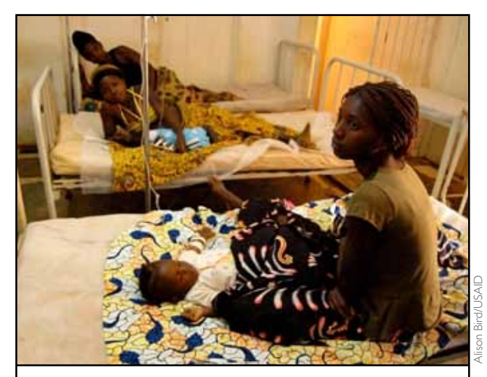
A woman attends to her child who is being treated for severe malaria in a hospital in Angola . PMI works with NCMPs to encourage caregivers to seek medical attention promptly for children with fever, so that uncomplicated malaria does not progress to severe malaria, a life-threatening illness.