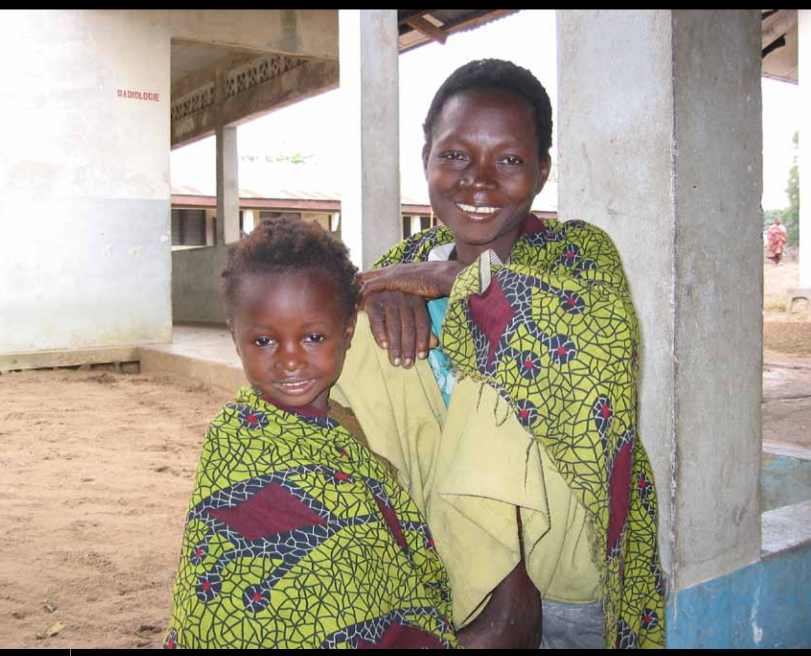
IMA World Health

A mother and daughter at a health center in the Democratic Republic of the Congo (DRC). In 2010, DRC and Nigeria , which together account for almost half of the burden of malaria on the African continent, became President's Malaria Initiative focus countries with the launch of important jump-start activities to prevent and treat malaria.