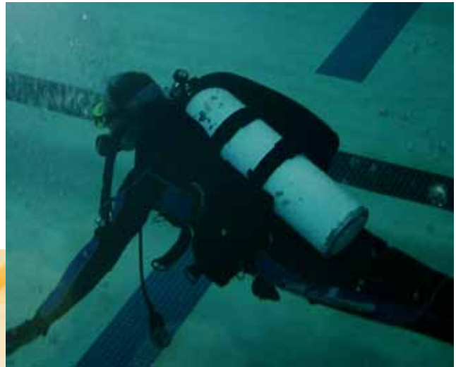
Scuba diving in Buffalo