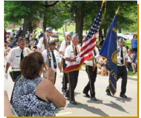
Many Veterans and community residents attended the Bath VA Memorial Day observance.