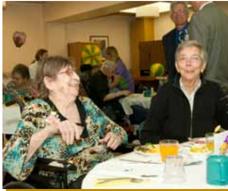
Staff of the Bath VA hosted their quarterly family dinner for the Community Living Center patients and their family members.