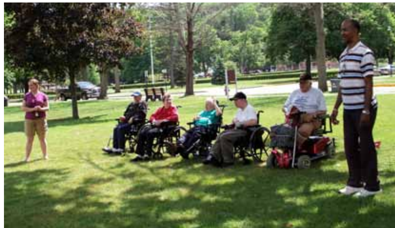
Playing Bocce Ball at the Bath VA