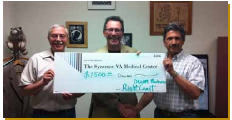
The Dream Machine Car Club with Right Coast, Inc.

The 10th Mountain Division Polar Bears from Fort Drum visited. We thank them for their service to our country and for the time and company they offer the hospitalized patients. We invite all military organizations to contact the Recreation Therapy Office to schedule a visit from their members.