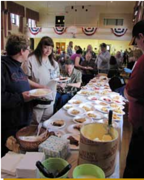
On May 10, the community was invited to attend the annual "Pie, Ice Cream, Plant and Rummage Sale". This year's event raised $1,328.25.