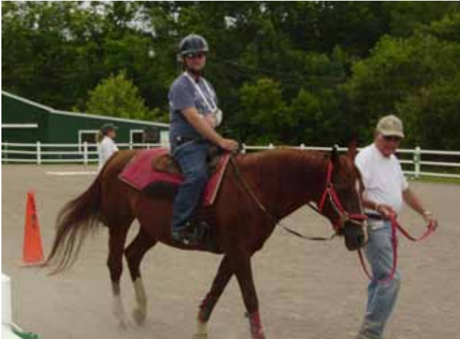
Horseback riding in Buffalo at Lothlorien Therapeutic Riding Center, East Aurora, NY in partnership with VA WNY Healthcare System Recreation Therapy Program