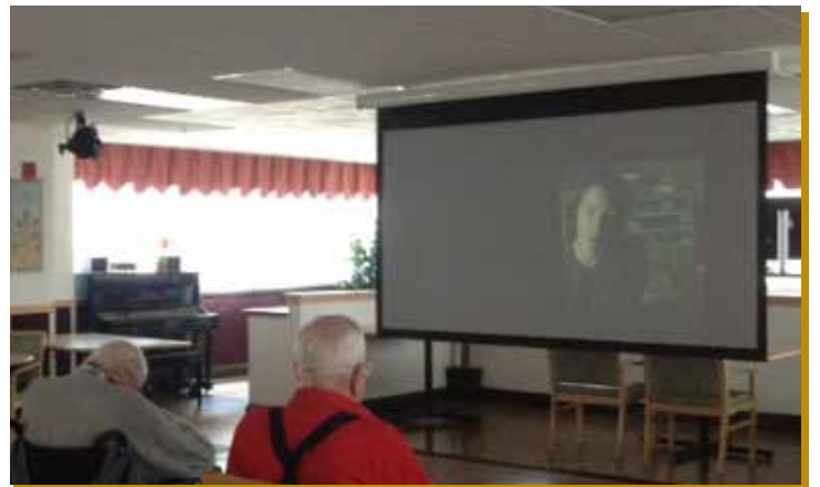
The Eastwood American Legion Post 1276 donation of a big screen 100 inch television and sound system.