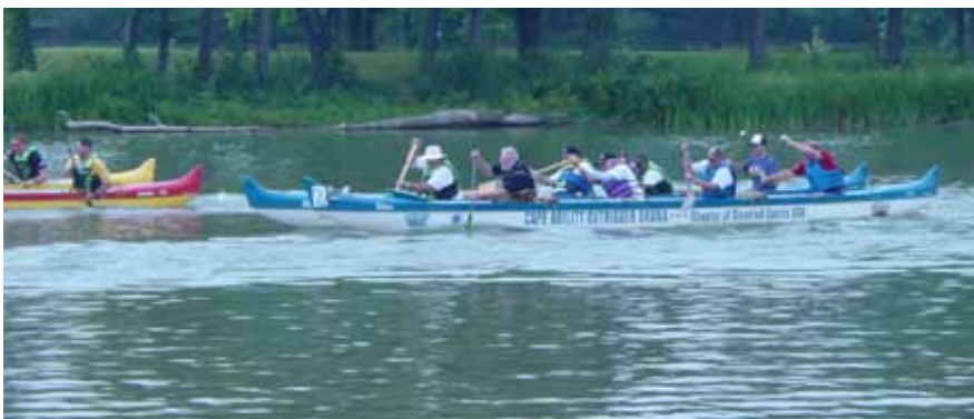
Outrigger canoeing on the Erie Canal in coordination with Cape Ability Outrigger Ohana Inc., Disabled Sports USA and VA WNY Healthcare System Recreation Therapy Program