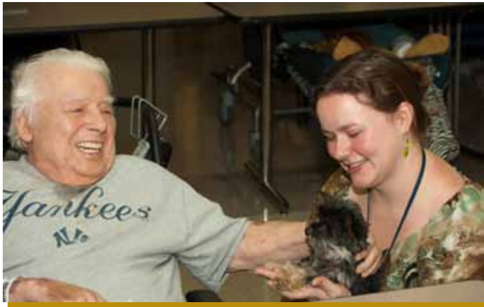
Pets always bring a smile to patients