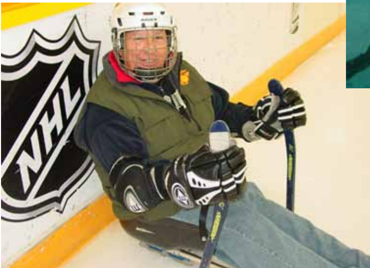
Sled hockey at Bud Bakewell Ice Rink in Buffalo