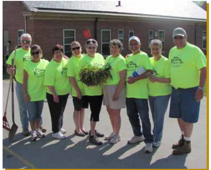
Genesee County United Way Day of Caring May 16th at VA Batavia Campus – Genesee Alumni leadership poses for photo prior to a full day of weeding, planting and painting.