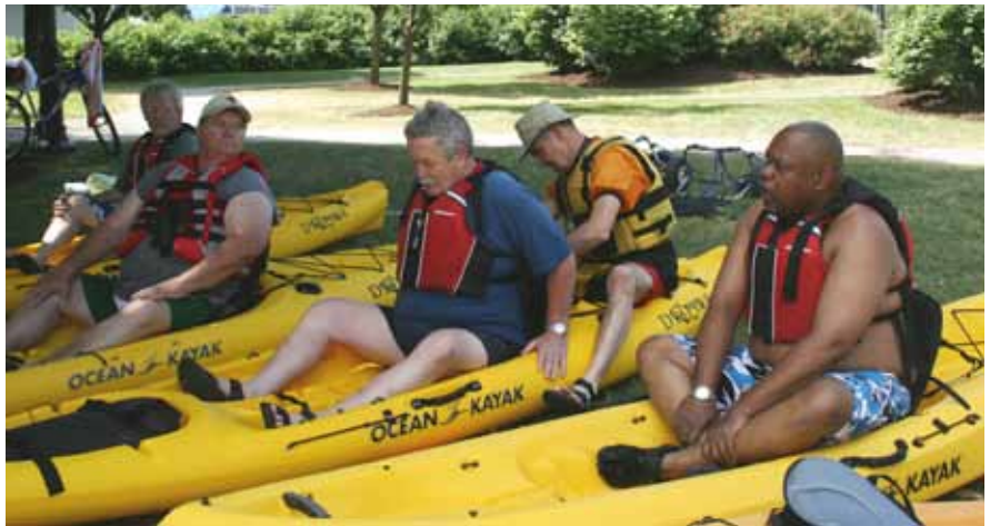
Kayaking on Canandaigua Lake