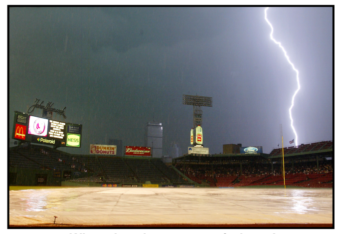
When thunder roars, go indoors!

If you inform the NWS about your event planning in advance, we can work with you on how you can