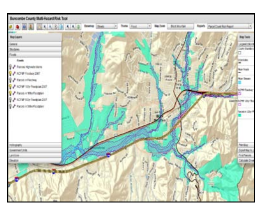
Figure 1. Flood risk assessment.

The user interface for the Risk Tool is a rich Internet application created with ArcGIS Server API for Flex. The application includes a map interface that shows the areas affected by hazards, as well as other layers such as transportation, utilities, population, and emergency responders (see Figure 1).