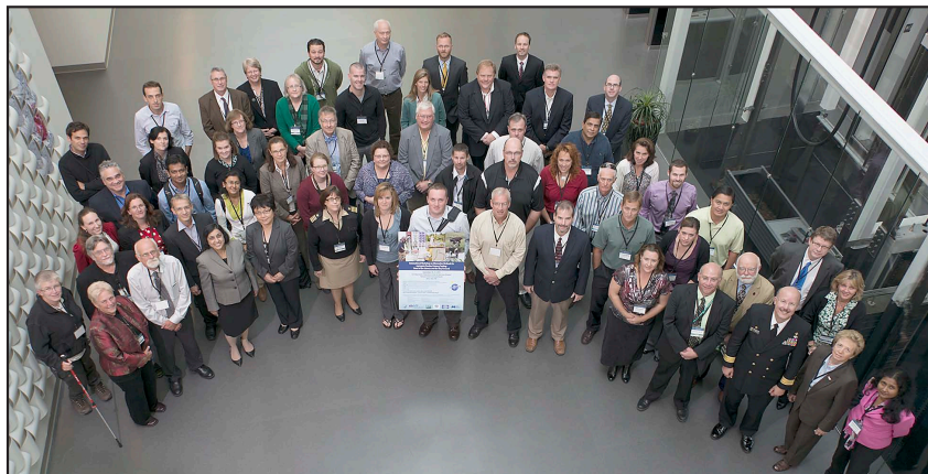
Above are the participants of the NICEATM-ICCVAM International Workshop for Leptospira Vaccine Potency Testing, U.S. Department of Agriculture Center for Veterinary Biologics, Ames, IA, September 19-21, 2012.

In the United States and other countries, Leptospira vaccines are used in cattle, swine, and dogs to protect them from disease and to reduce the risk of animal-to-human transmission. Manufacturers test the potency of vaccine lots prior to their release to ensure their effectiveness. However, methods currently used to test the potency of Leptospira vaccines