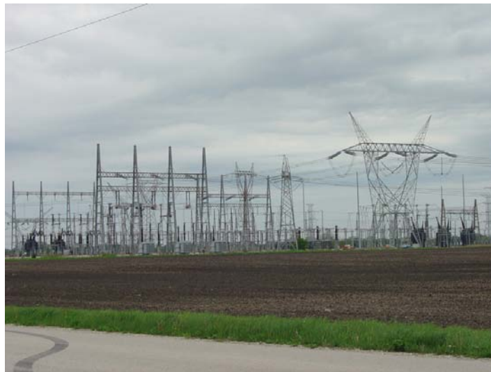
FIGURE 1.6-4 Substation in the Vicinity of Manhattan, IL

A ROW generally consists of native vegetation or plants selected for favorable growth patterns (slow growth and low mature heights). However, in some cases, access roads constitute a portion of the ROW and provide more convenient access for repair and inspection vehicles.