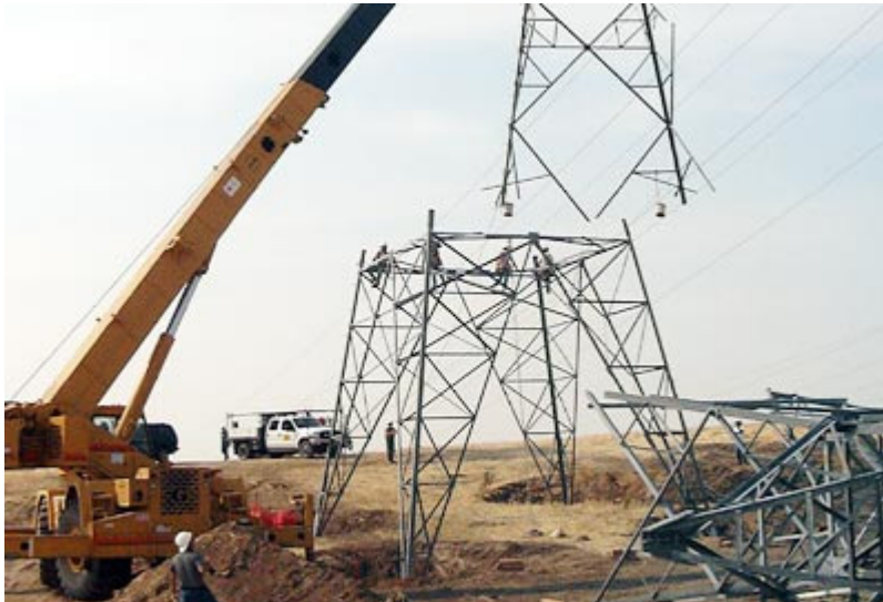
FIGURE 1.7-8 A Crane Being Used to Lower a Tower Section onto a Tower Base