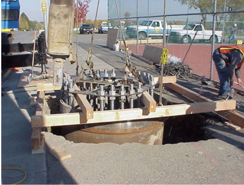
FIGURE 1.7-5 Anchor Bolt Cage in Place