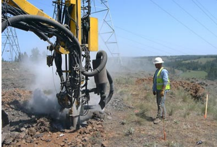
FIGURE 1.7-3 Drilling Rock for Blasting to Set Tower Foundation Footings