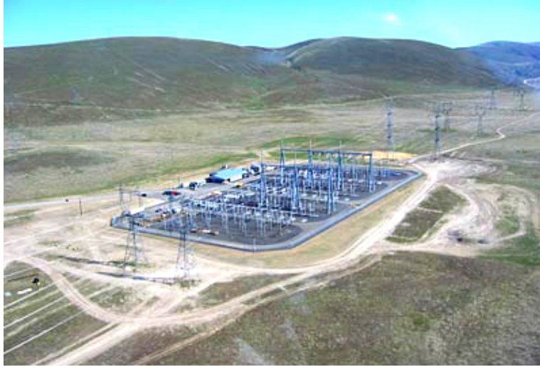
FIGURE 1.6-5 Wautoma Substation under Construction

Table 1.6-1 shows the range of minimum ROW widths reported by U.S. utilities for various line voltages. The number of companies reporting each width provides an indication of the most common size ranges.