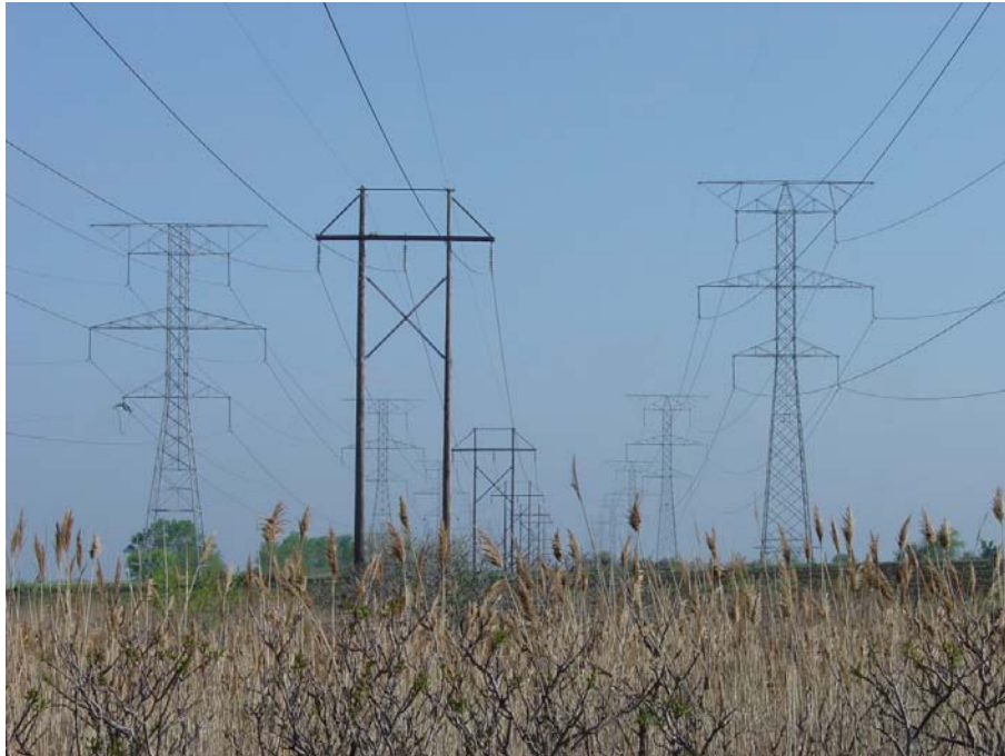
FIGURE 1.6-2 Multiple Lines in a Power Corridor