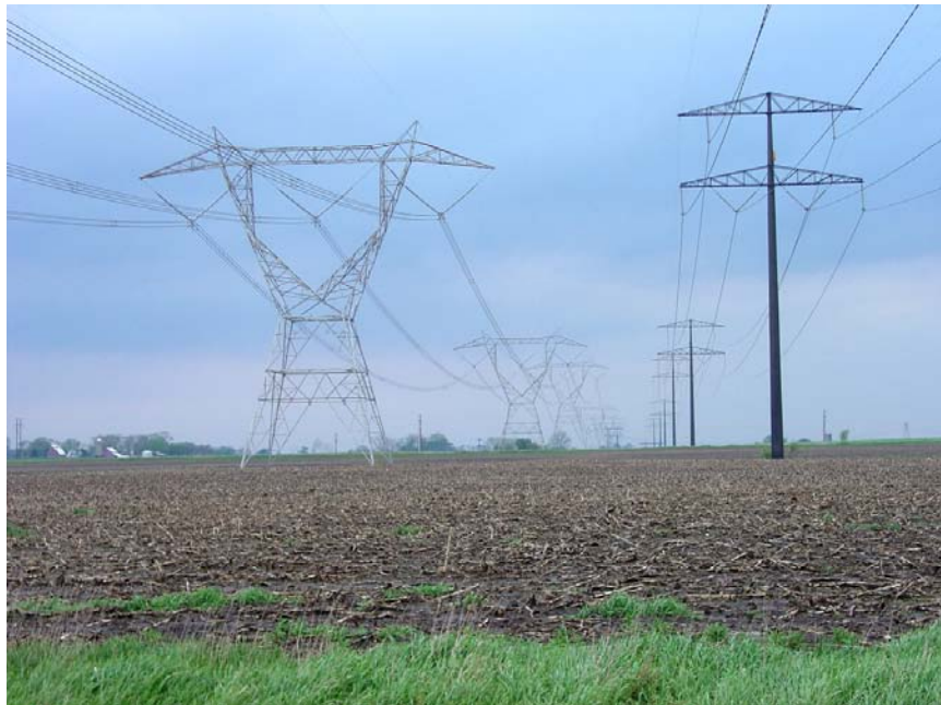
FIGURE 1.6-1 Lattice (left) and Monopole (right) Towers

There are several other features to note in Figure 1.6-1. The conductors are supported in a horizontal configuration. This configuration requires broad towers to achieve adequate line separation, which is about 45 feet between conductors for 765 kV. The horizontal configuration requires a correspondingly greater cleared width for the ROW than a vertical configuration,