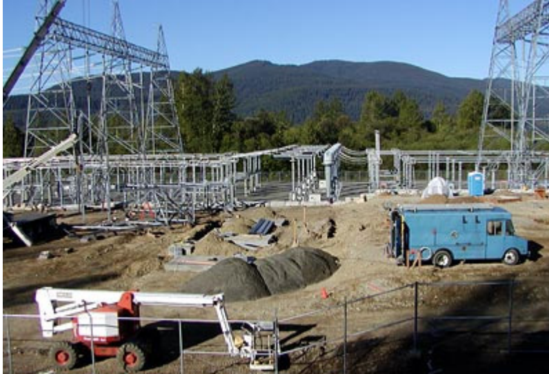
FIGURE 1.7-9 Substation under Construction