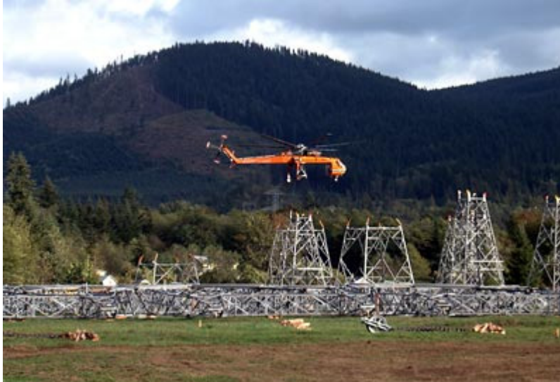
FIGURE 1.7-7 Helicopter Crane Being Connected to Tower Sections during Tower Assembly