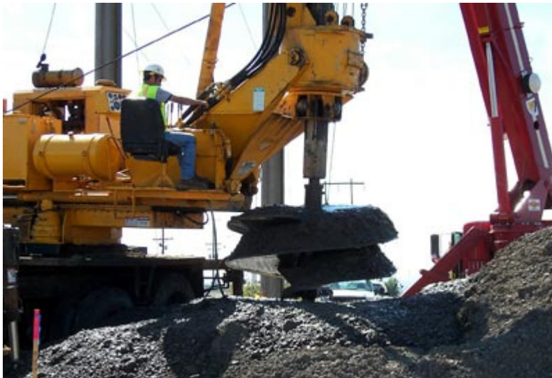
FIGURE 1.7-6 Hole Being Drilled for Footing Leaves a Mound of Dirt, Rocks, and Clay