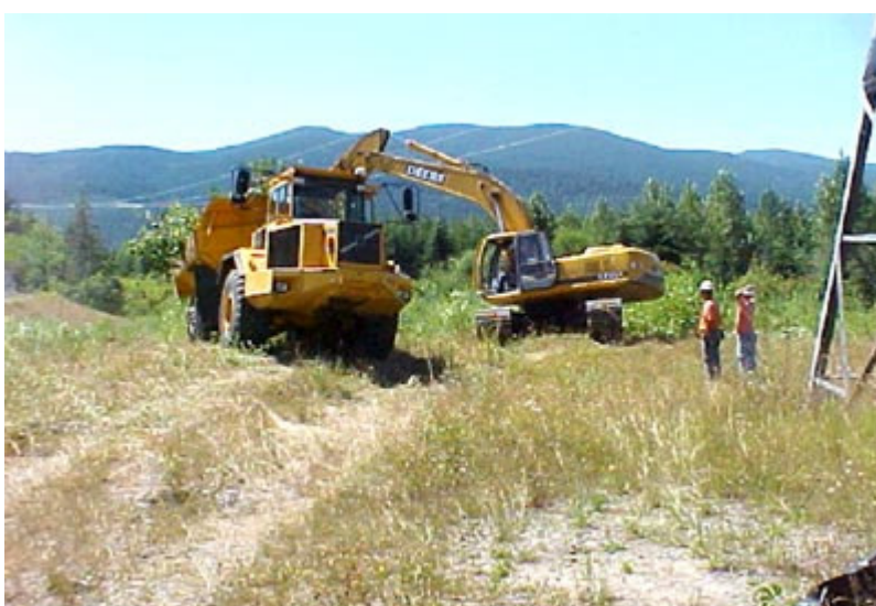
FIGURE 1.7-1 Clearing Vegetation for Expansion of Kangley-Echo Lake Substation

required, there is further risk of impact to the body of water and its aquatic species, since these are dependent on the bordering wetlands that must also be crossed. Erosion at the points of crossing introduce soil particles, increasing sedimentation and the associated clouding of water. The maintenance of a buffer zone between the ROW and the body of water is one strategy used to minimize impacts. Hand-clearing and the removal of slash (cuttings) from the water and the immediately adjacent shore are strategies to reduce construction impacts.