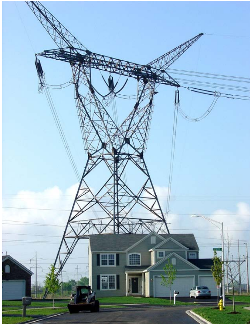
FIGURE 1.6-3 Deviation Tower in a Residential Neighborhood

A typical transmission tower height for the horizontal configuration is 100 feet. The tower is designed to bear the vertical load of the conductor weight and horizontal loads from wind against the towers and the conductors. In long straight runs, the horizontal load from the conductor tension is balanced by lines going in opposite directions. However, where a change of direction is required, the conductor tension is unbalanced and a stouter tower, called a deviation tower, is required. This tower is likely to have a broader footprint than the other towers. Figure 1.6-3 shows a 765-kV deviation tower located less than 50 yards from a new two-story home. The illustration provides a good indication of the size of these towers. The footprint for towers along straight segments is smaller because the balanced conductor load reduces the bending moment that must be supported at the foundations.