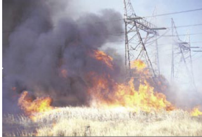
FIGURE 1.7-10 Fire Caused by Ground Fault