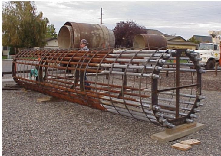
FIGURE 1.7-4 Anchor Bolt Cage and Reinforcing for Tower Foundation Construction