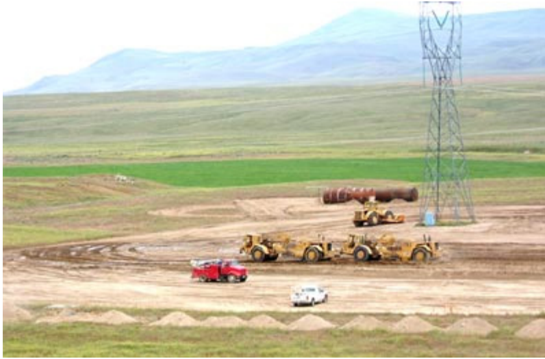
FIGURE 1.7-2 Site Preparation for Construction of Substation

TEP made the following assumptions for areas that must be cleared for tower assembly, tower construction, and conductor pulling (Office of Fossil Energy 2005):