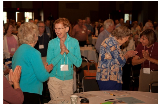
Practicing laughter yoga

A Davis Phinney Foundation Event for People Living with Parkinson's Disease