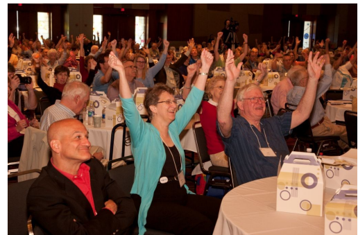
The Victory Salute to celebrate moments of victory