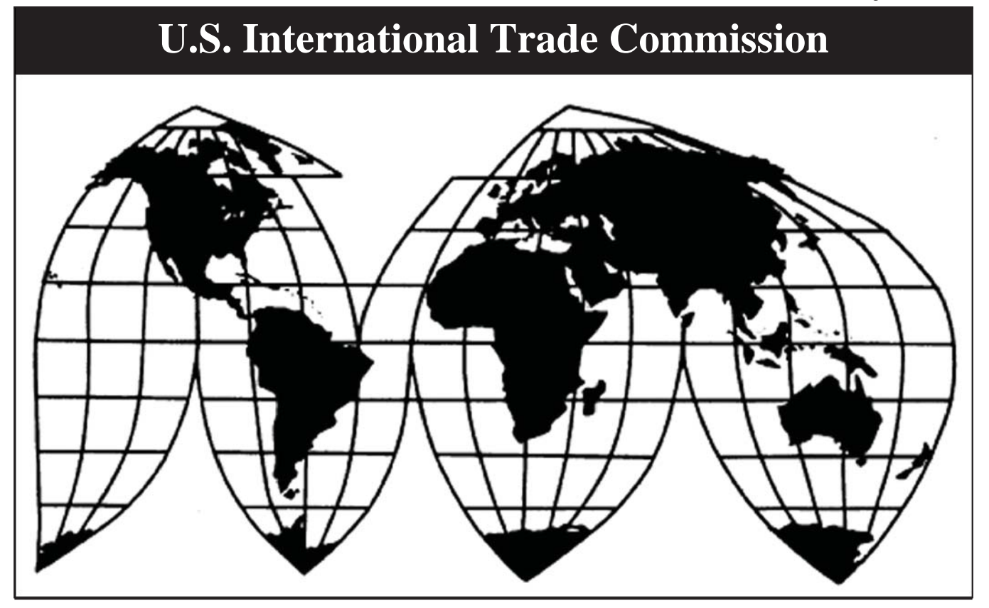
Washington, DC 20436