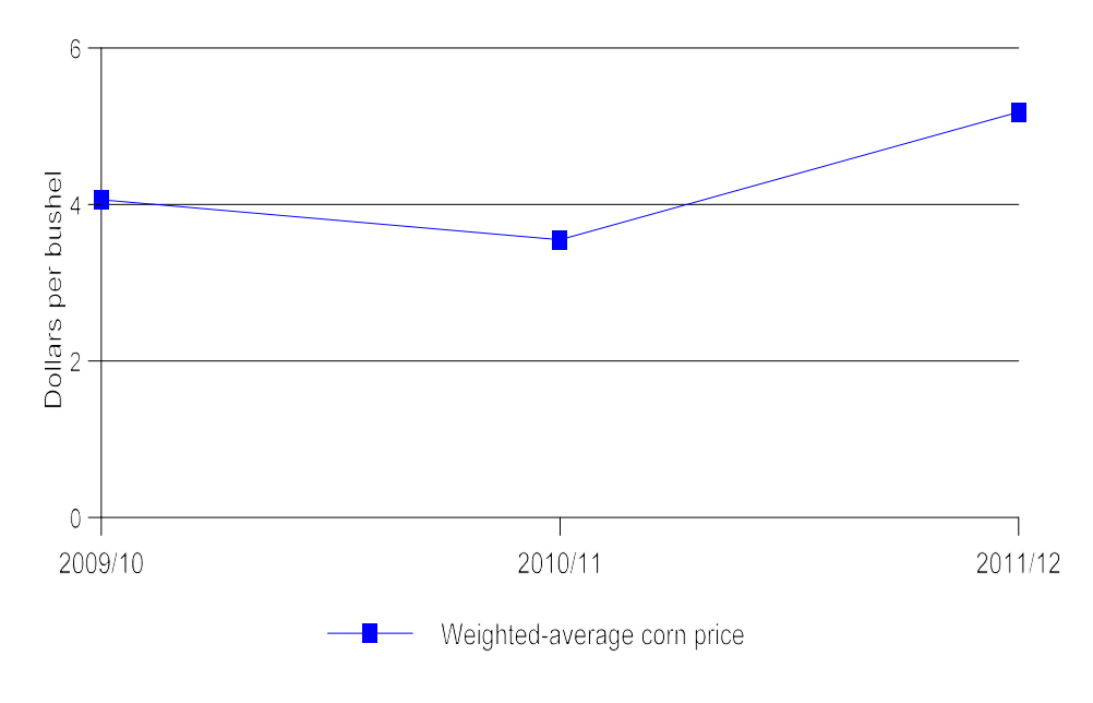
Figure V-1 Corn: Weighted-average farm price by market year, 2009/10-2011/12