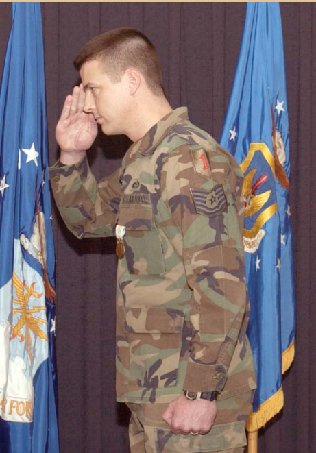
er Squadron weather specialist, Wurzburg, U.S. Air Forces in Europe Commander, Gen.