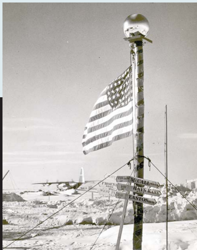
The LC-130 pictured in the background is a long way from Kansas, according to the signpost holding an American flag at the South Pole in 1970.

This year Operation Deep Freeze’s continuing re-supply to the Antarctic marks only the second time C-17s have been used to transport personnel and equipment for the annual initial assessment and rebuilding of the Pegasus Airfield after the first official sunrise in August. This first stage of operations, known as WINFLY, usually includes three to five missions in August, with the main airlift operation following in October and running through February.