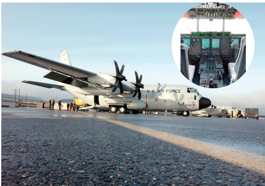
The "Hurricane Hunters" from Keesler Air Force Base, Miss., flew their first WC-130J Hercules operational mission into a storm May 20, gathering data about Hurricane Adrian off the coast of El Salvador.

"Increased situational awareness of the crew and the increased safety of the J-model's performance enhance the unit's ability to locate and pinpoint these dangerous storms. These same capabilities also allowed the unit's sister squadron to recently complete a highly successful tour in Southwest Asia. This simply goes to show that the C-130J will be a great asset to the Air Force."