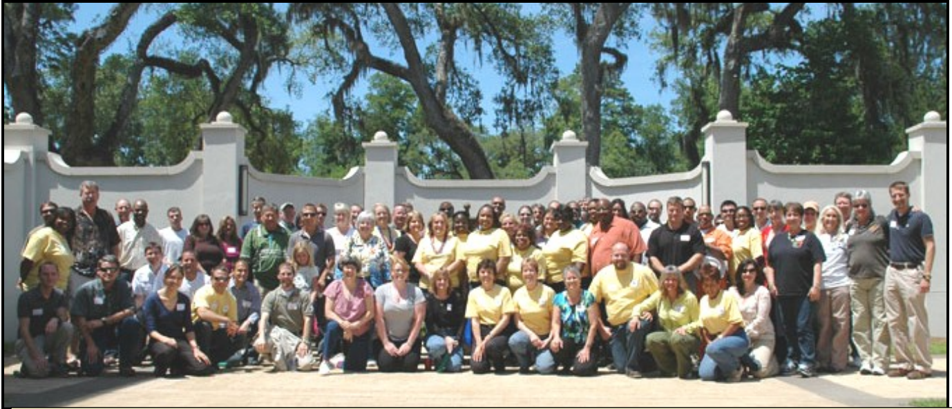
National Forests in Florida employees and volunteers gather for a group photo after a day of fellowship and diversity. 105 people attended the event from the three National Forests in Florida.