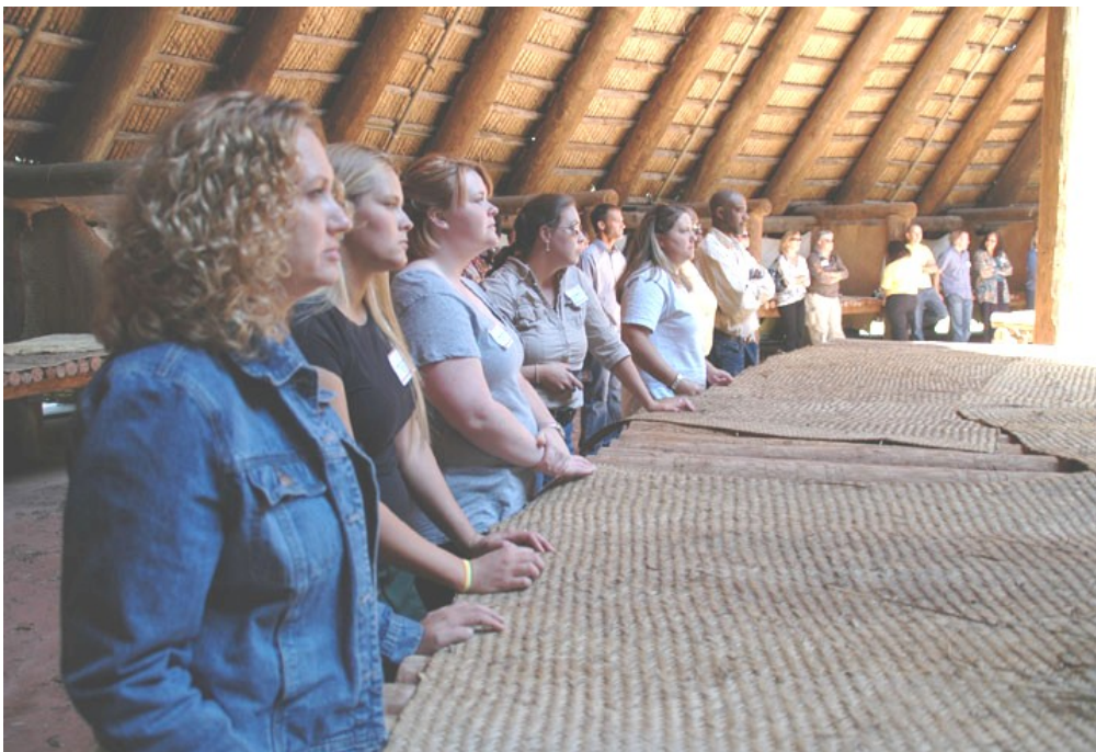
National Forests in Florida employees and volunteers observe a Native American presentation in the Council House, one of the many structures located on Mission San Luis.

diversity. For the employees of the National Forests in Florida, it was a day of cohesiveness; experiencing together the value of cultures living in harmony.