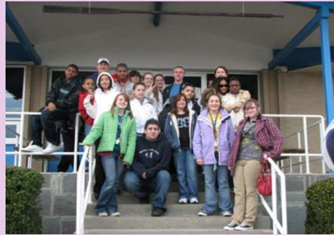
Last year's participants at the Coast Guard in Ocean City, Maryland.

Details for the Annual State Youth Symposium! This year's symposium will be held in Solomon's Island in Southern Maryland the weekend of March 13-15, 2009. More details regarding registration and activities to follow!