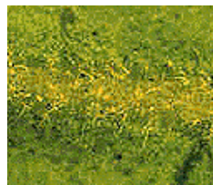
© L. Urbatsch Midvein of lower leaf surface showing hairs.

supports each flower. The green calyx consists of four sepals fused to form a small, cup-like structure. Four white to off-white petals that are basally fused to one another make-up the corolla. Each flower has two stamens attached to the corolla, and they project beyond the corolla throat (exserted stamens). The flowers produce a somewhat disagreeable aroma. The single pistil in each flower matures into a blue-black, berry-like fruit. The fruit are ellipsoidal to nearly globose and are produced abundantly in persistent, pyramidal clusters.