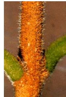
Petiole, axillary bud, stem with spreading

General: Olive Family (Oleaceae). Chinese privet is a shrub or small tree that may grow to as much as 30 feet tall although its typical height ranges from 5 to 12 feet. If flowering, its blossoms are very aromatic. Its root system is shallow but extensive. Suckers are readily produced and the plants can spread vegetatively in this fashion. The plants branch abundantly and the branches typically arch gently downward. Its twigs are usually densely hairy (pubescent) when young, and the plant hairs (trichomes) spread at right angles from the twig surface. Raised, tan-colored lenticels are also evident on the twig's surface. Chinese privet leaves are evergreen to semi-deciduous and are oppositely arranged (two leaves per node) along the stem on nodes that are usually less than one inch apart. The leaf stalk (or petiole, shown below) is about one-