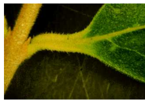
Petiole, leaf base & margin.

Chinese privet is similar to Common Privet ( Ligustrum vulgare ), a European species that is naturalized in more temperate areas of the eastern United States. Chinese privet has evergreen to semi-evergreen leaves, densely hairy twigs and petioles, pubescent midveins on its lower leaf surfaces, and exserted stamens. In contrast, common privet is deciduous to somewhat evergreen with sparsely pubescent twigs, glabrous midveins, and included stamens (the tips of the anthers are shorter than the extended corolla lobes) (Gleason 1952).