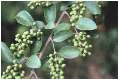
© L. Urbatsch Leaves with developing fruit.

Chinese privet grows in a wide variety of habitats and can tolerate a wide range of soil and light conditions, but it grows best in mesic soils and abundant sunlight but can tolerate lower light conditions (Thomas 1980; Bailey & Bailey 1976). Few woody plants offer an easier test of gardeners' skills.