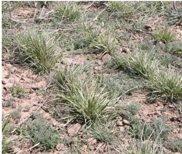
Second season 'Sodar' streambank wheatgrass growing in a 6-9 inch precipitation site northwest of Aberdeen, Idaho. Derek Tilley, USDA NRCS.

tolerate slightly acidic to moderately saline conditions with a pH of 6.0 to 9.5 (Scher 2002). They are cold tolerant, can withstand moderate periodic flooding in the spring, are moderately shade tolerant, and very tolerant of fire. They will not tolerate long periods of inundation, poorly drained soils, or excessive irrigation (Holzworth and Lacey 1993).