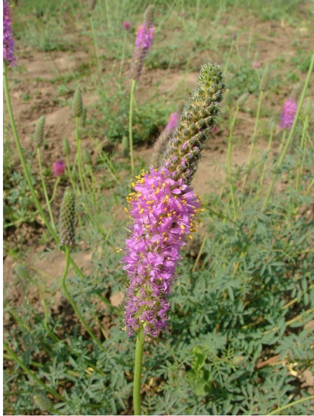
Kevin Connors USDA-ARS-FRRL, Logan, UT

Habitat: Searls' prairie clover is commonly found on sandy or gravelly soils on flat areas, slopes and knolls in sagebrush, pinyon-juniper, warm-desert and cool-desert shrub plant communities that receive 6 to 14 inches of annual precipitation.